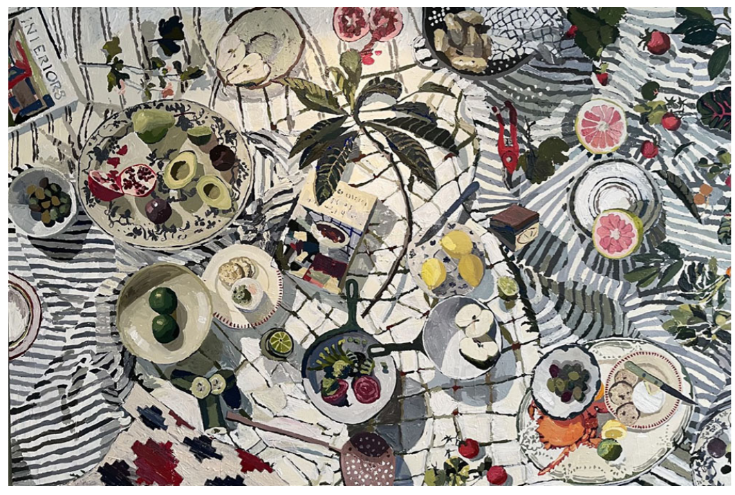
Above Picnic by the Weir 2021 acrylic on belgian linen 260 x 140 cm