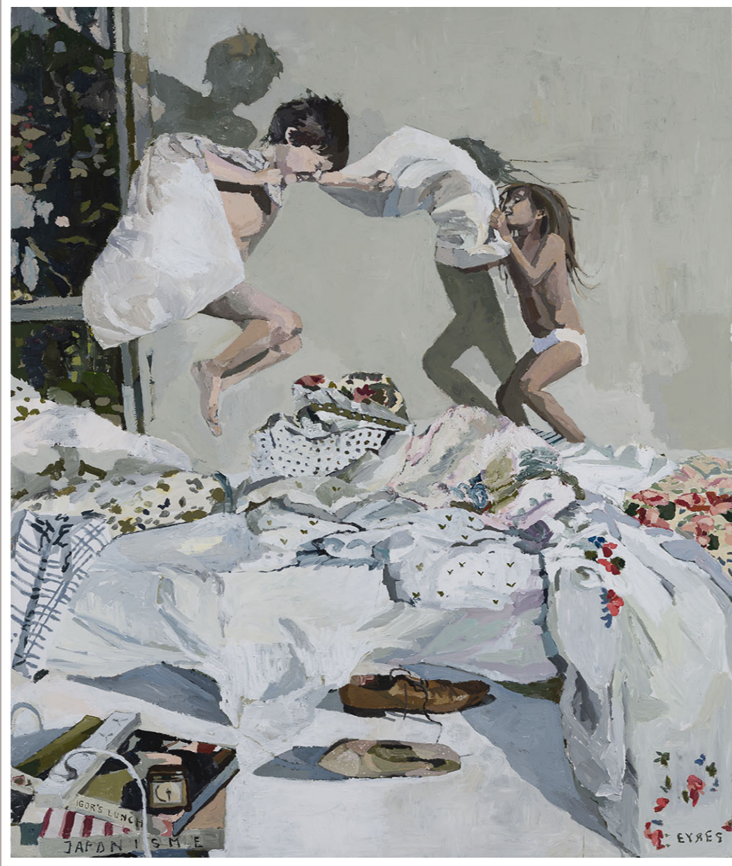
Above Play Time 2020 acrylic on belgian linen 120 x 160 cm