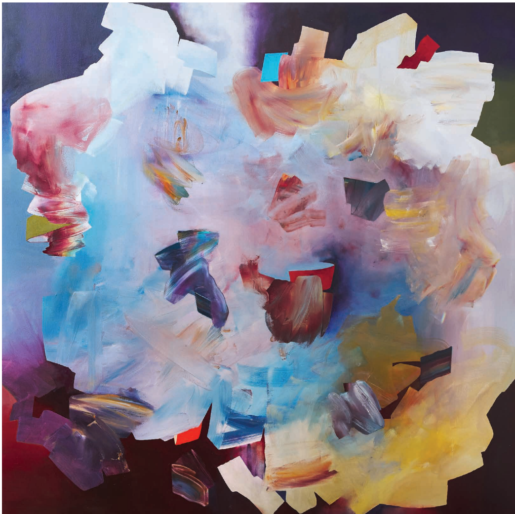
Right Cirrus 2018 Oil on canvas 102 x 102cm