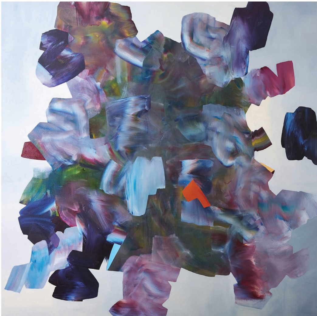
Above Wax on Wax off 2018 Oil on canvas 152 x 152cm