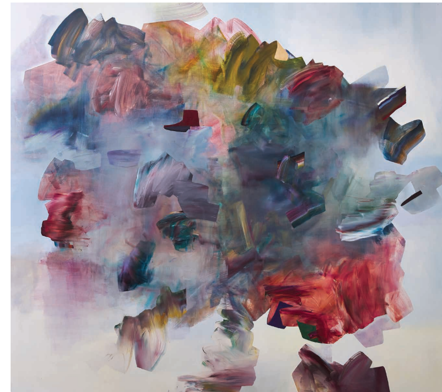
Above No tricks all treats 2019 Oil on polycotton 197 x 183cm