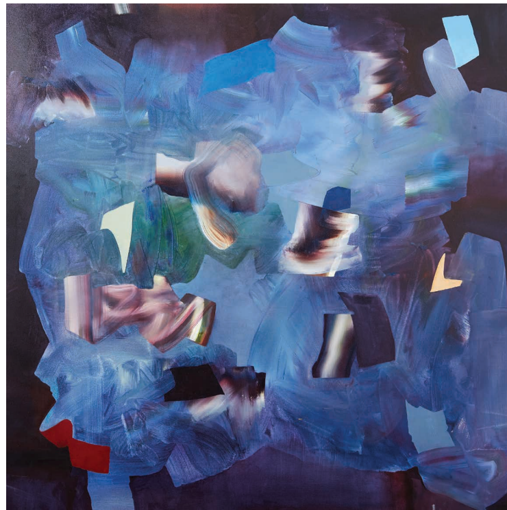
Left Counteract 2018 Oil on canvas 152 x 152cm