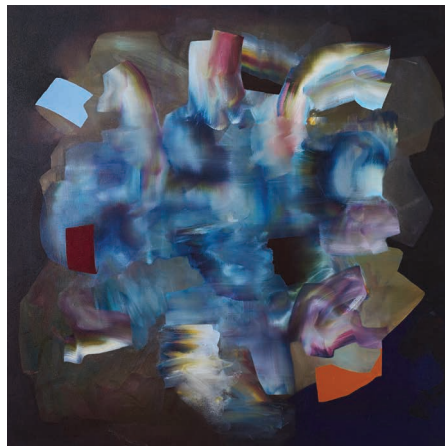
Cover With Eyes Peeled 2019 Oil on canvas 183 x 183cm