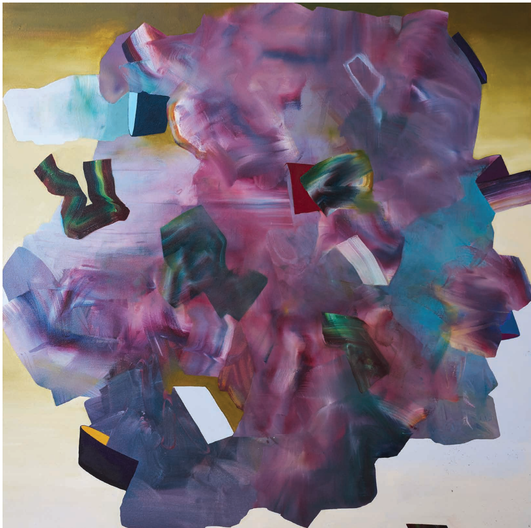
Above Counterpunch 2018 Oil on canvas 122 x 122cm