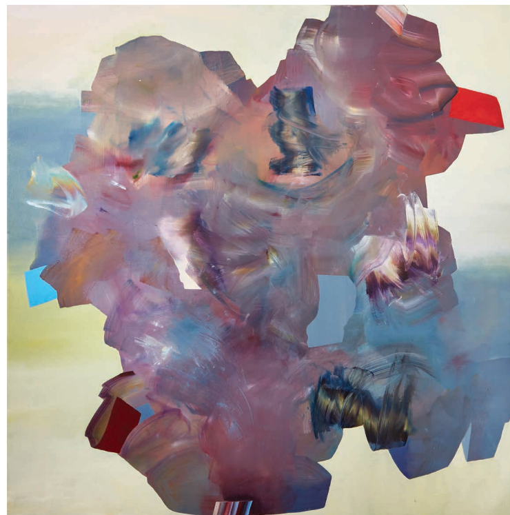
Right The Breaks 2018 Oil on canvas 152 x 152cm