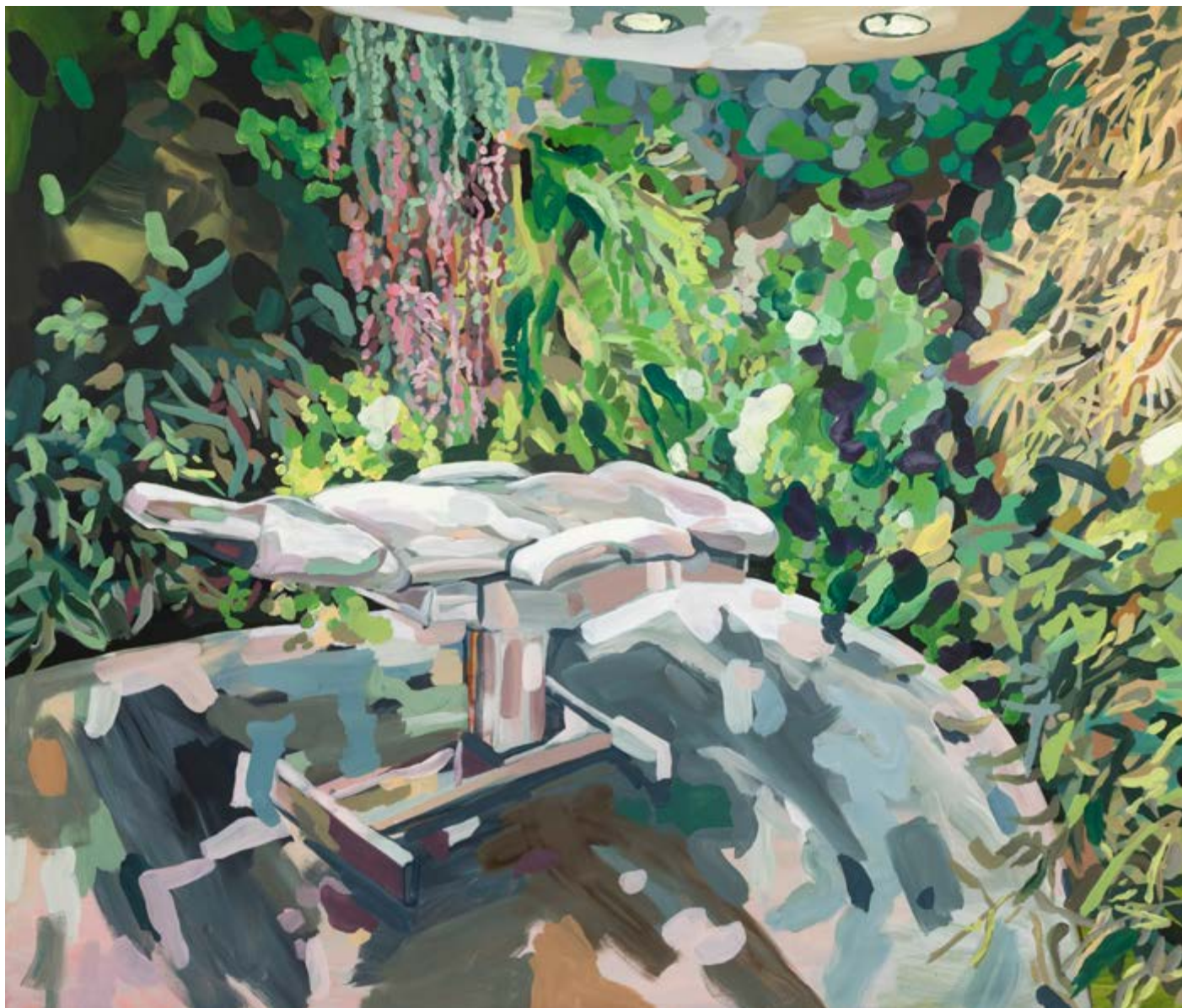
First Class Qantas Lounge Massage Room