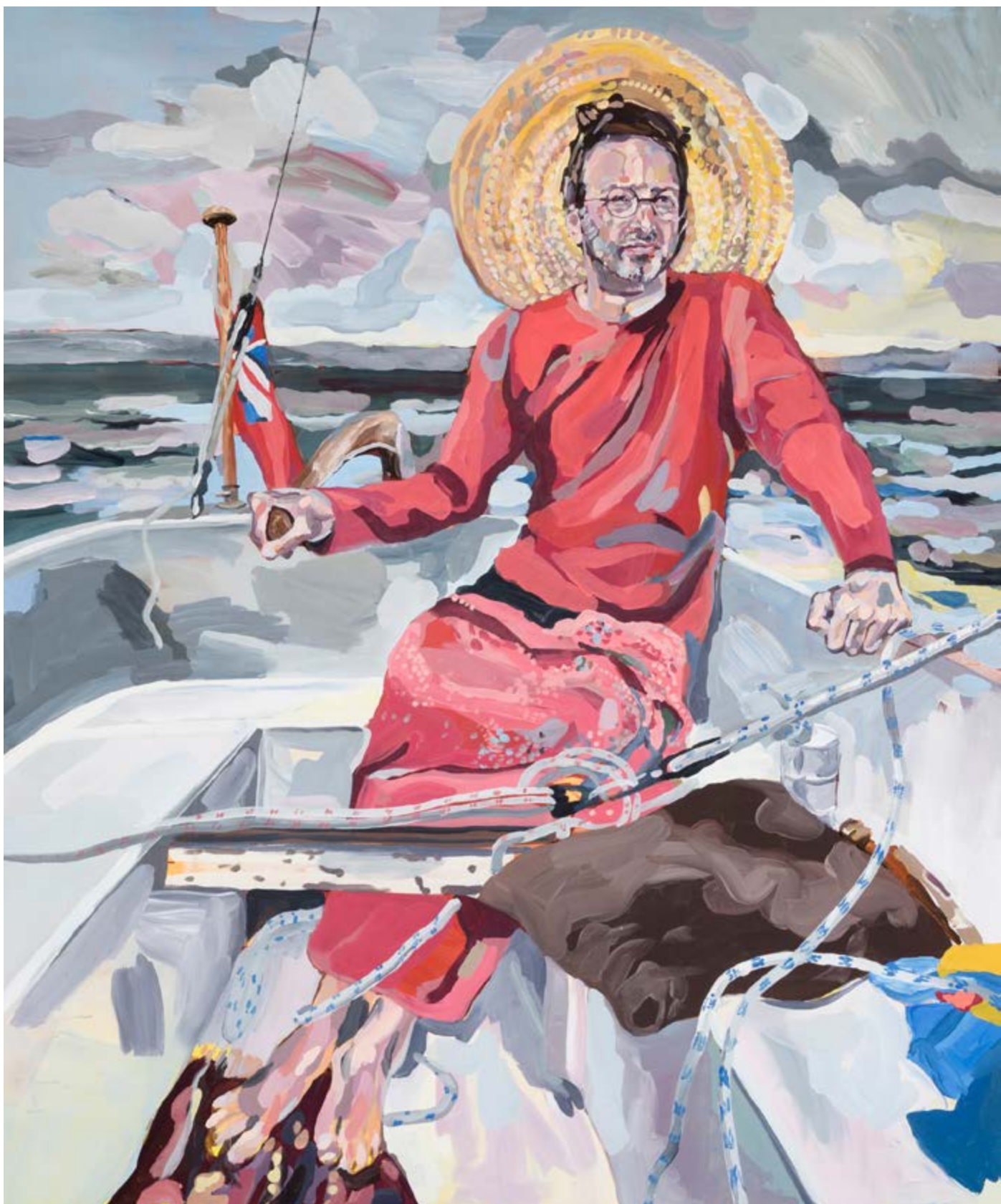
Steering for Dream 2019 acrylic on polyester canvas 183 cm x 152 cm $14,000