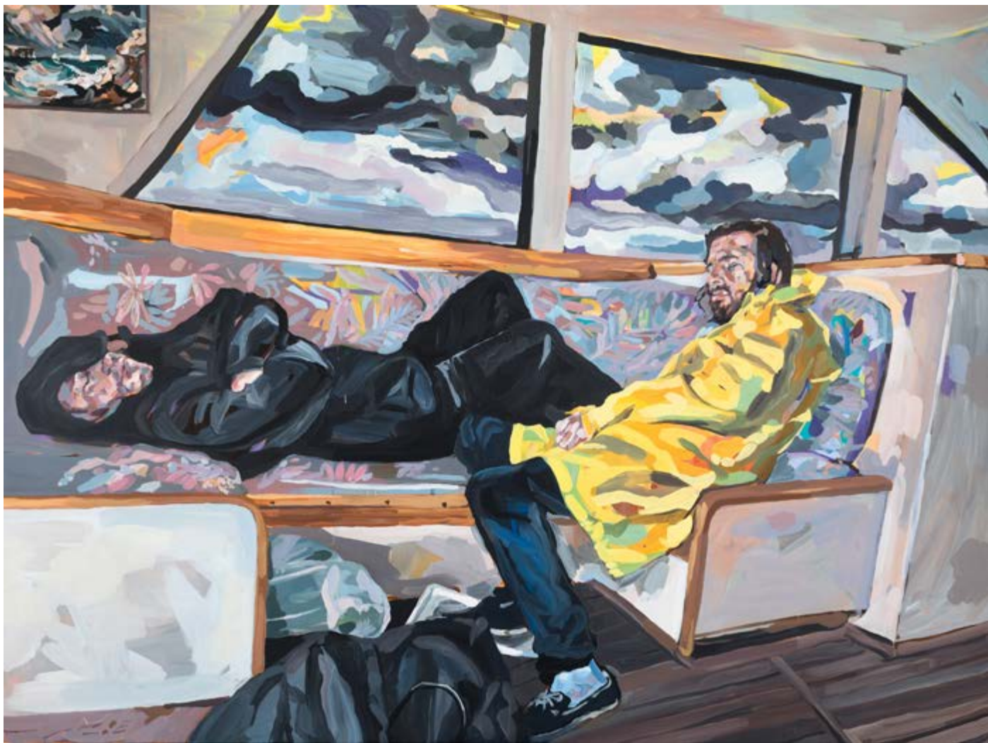
Seasick Fisherman at Brown's Mountain 2019 acrylic on polyester canvas 245 cm x 183 cm $20,000