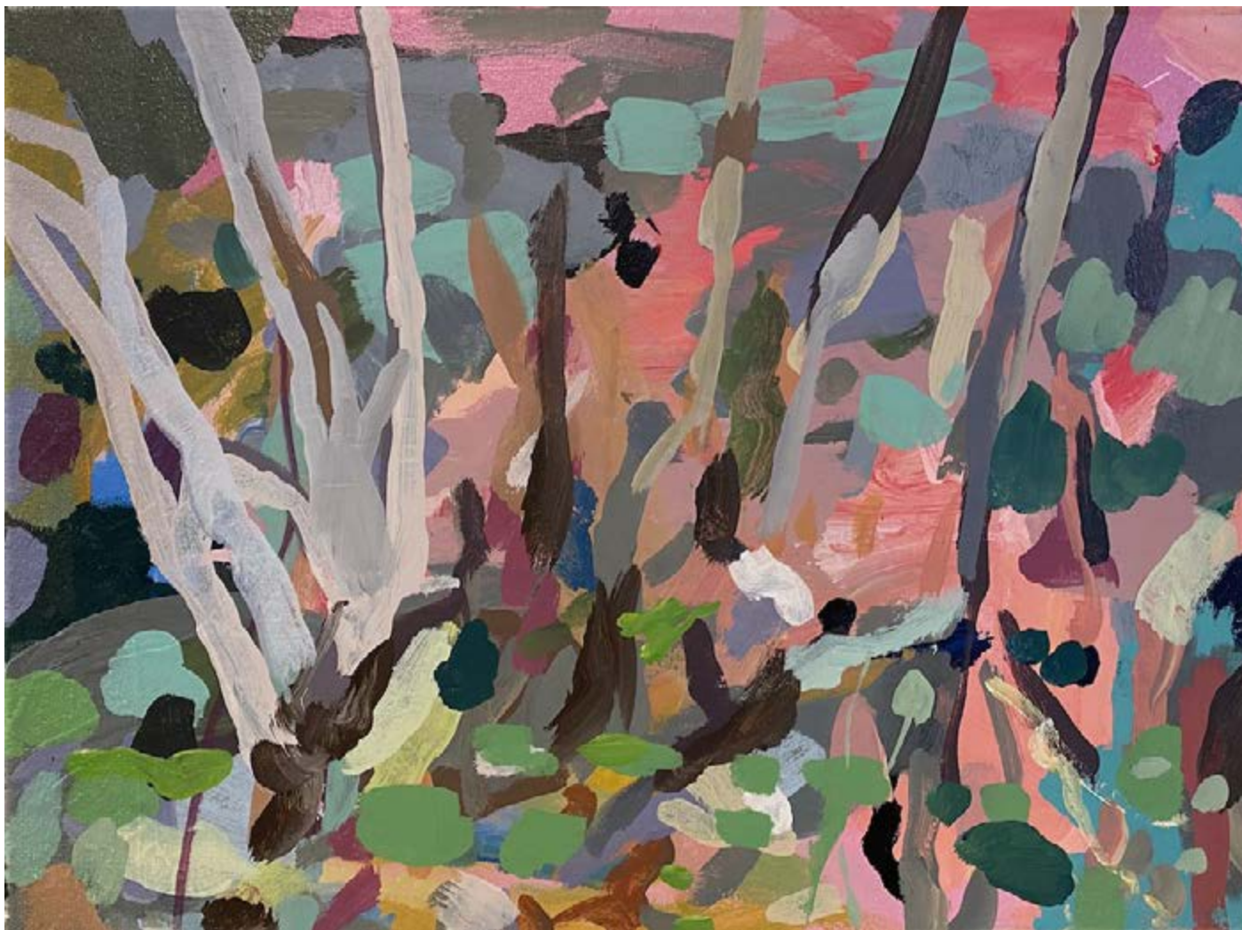
Paperbark Swamp 2022 acrylic on canvas 51 cm x 40 cm $4,500