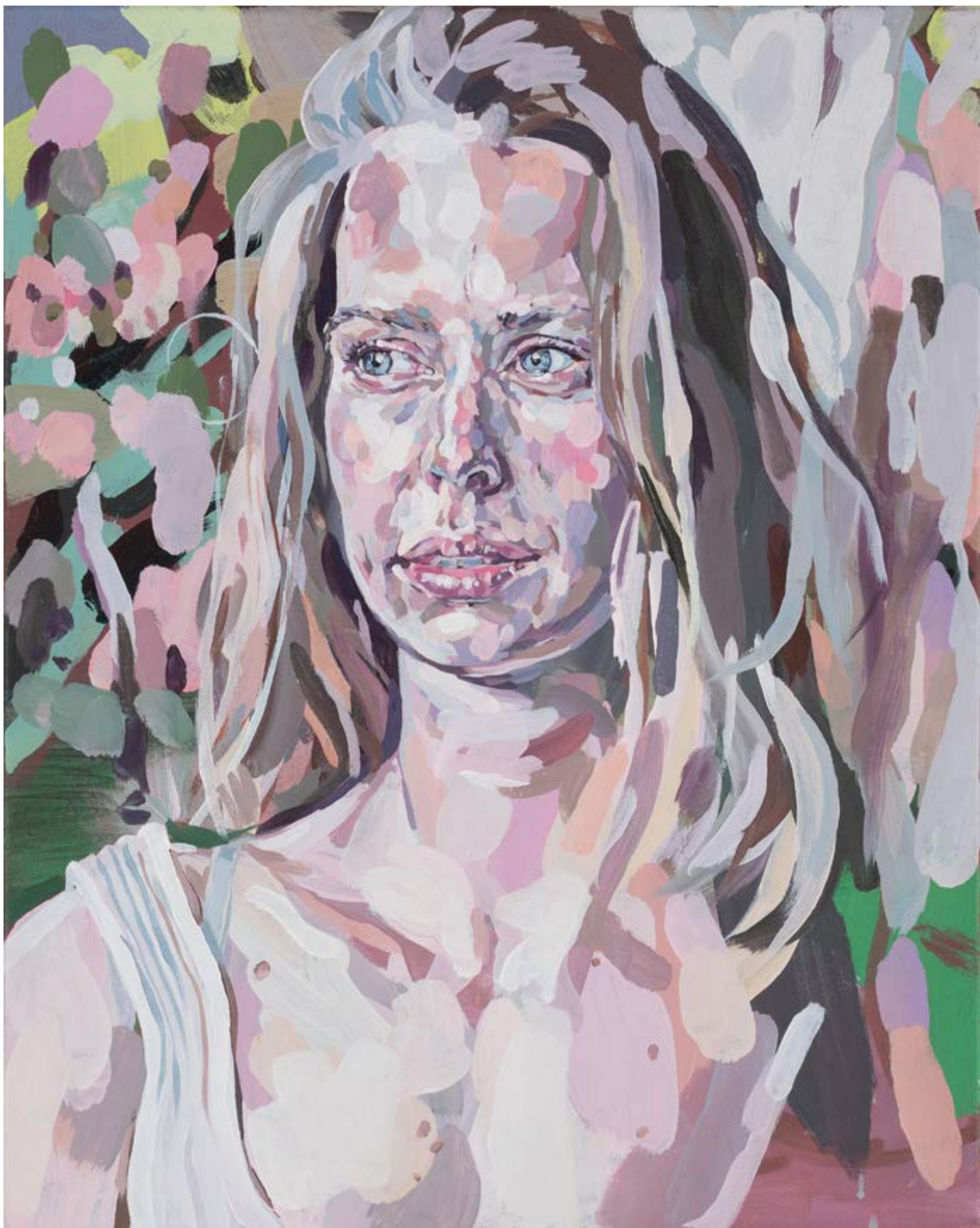
Camille 2021 acrylic on canvas 51 cm x 40 cm NFS