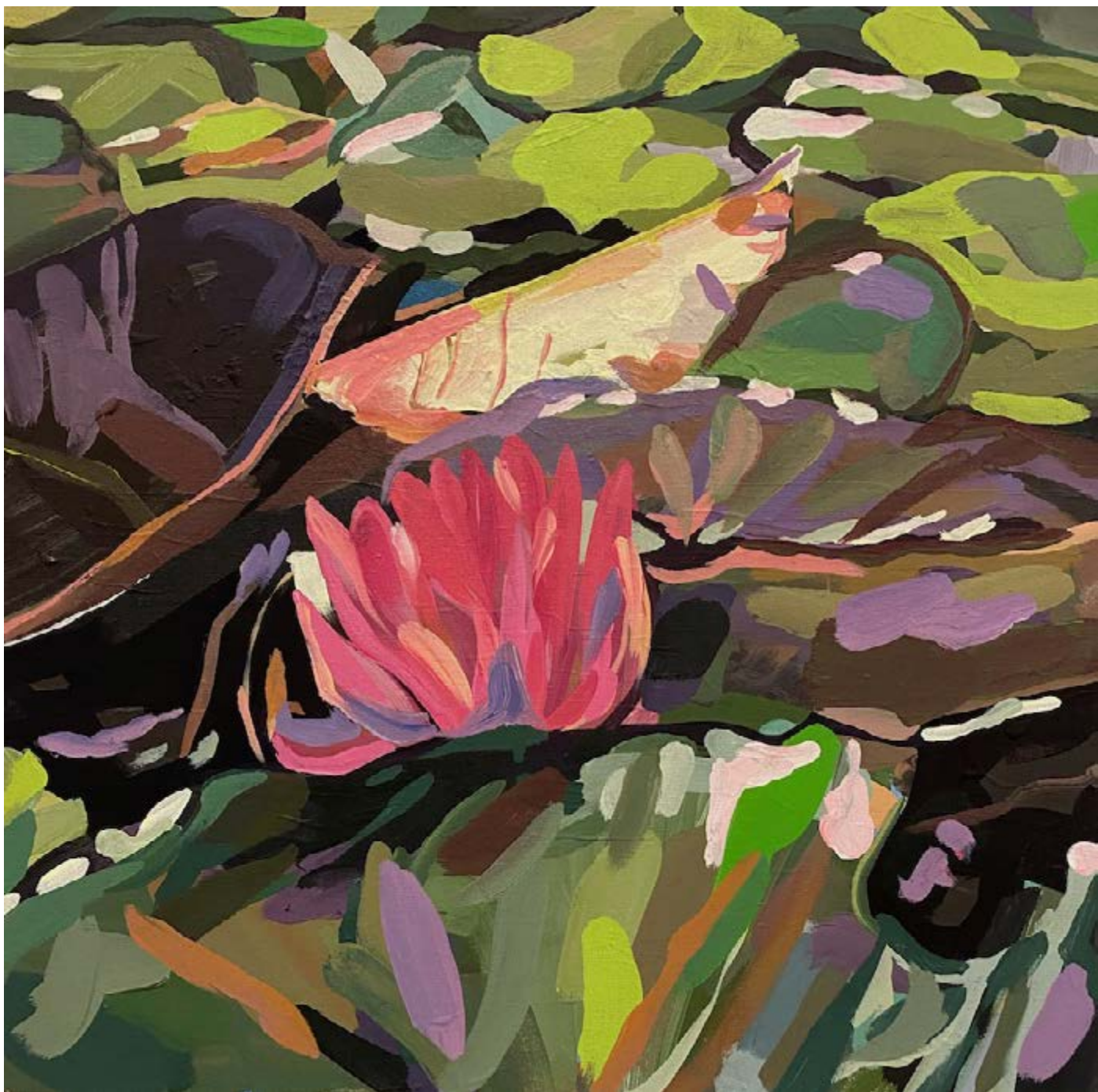
Waterlily Pond 2022 acrylic on canvas 60 cm x 60 cm $5,000