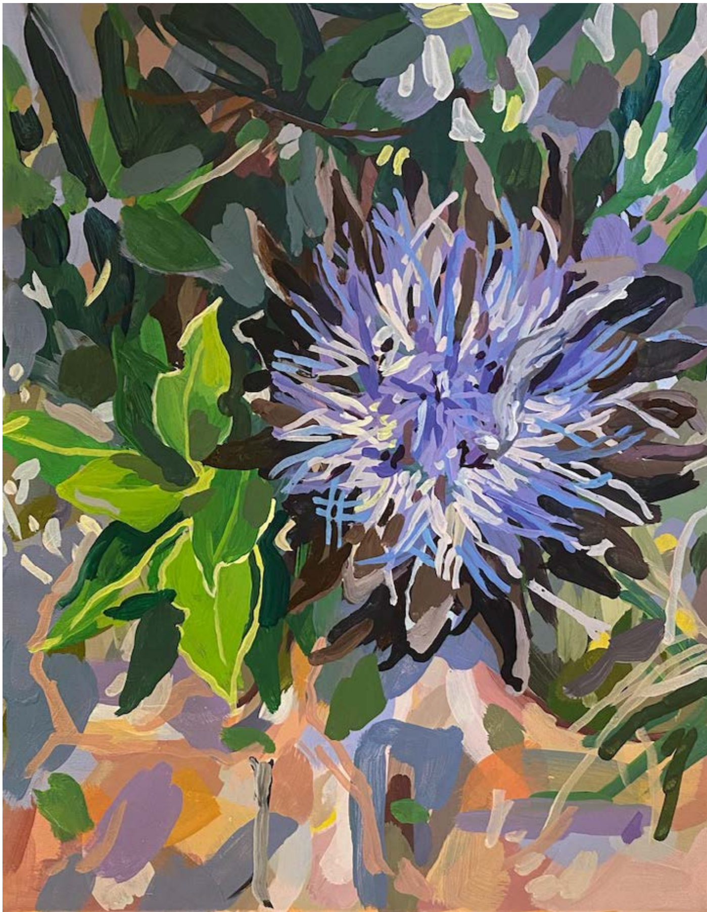
The Artichoke and the Slug 2022 acrylic on canvas 51 cm x 40 cm $4,500