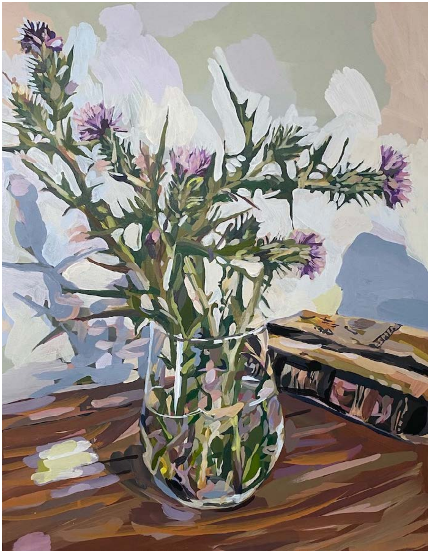
Thistle and Coffee 2022 acrylic on canvas 82 cm x 60 cm $5,500