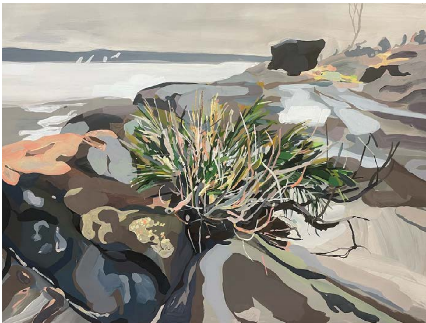
Whistling Pine 2015 acrylic on canvas 120 cm x 90 cm $9,000