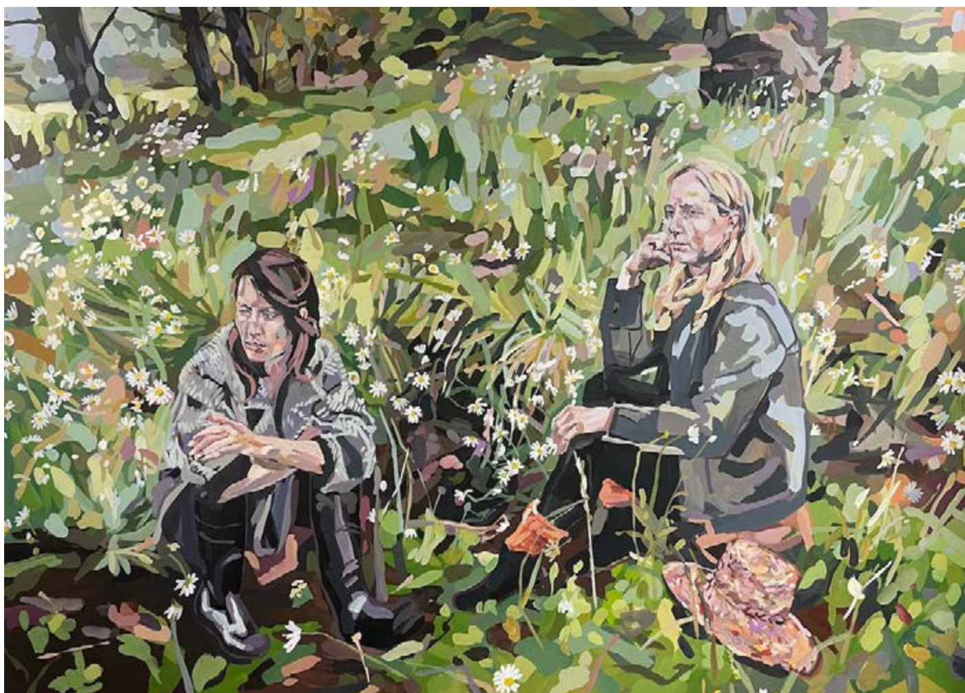
The Wombat Hole 2022 acrylic on canvas 153 cm x 213 cm $16,000