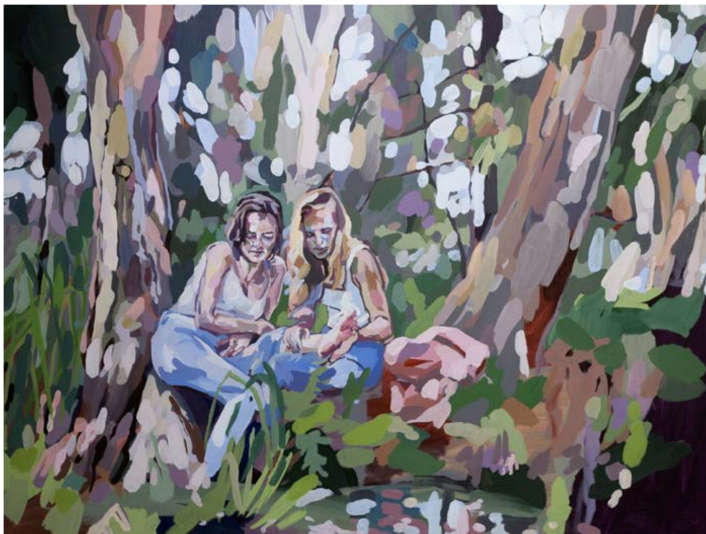
The Thorn 2 2021 acrylic on canvas 120 cm x 90 cm $9,000