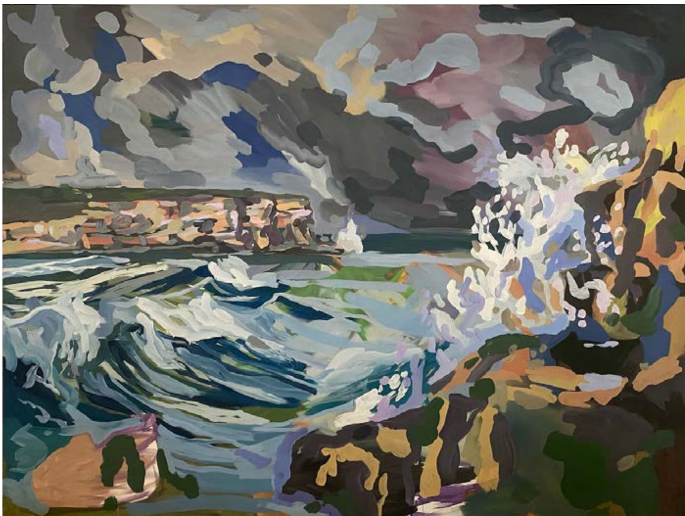
Sydney Heads after Conrad Martin 2022 acrylic on canvas 245 cm x 183 cm $20,000