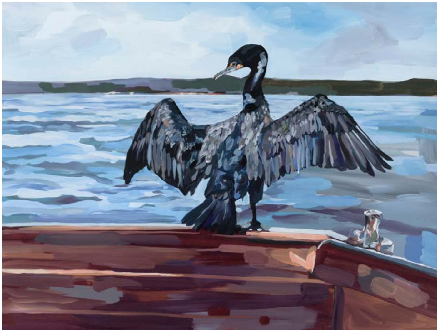
The Shag 2020 acrylic on canvas 121 cm x 90 cm $9,000