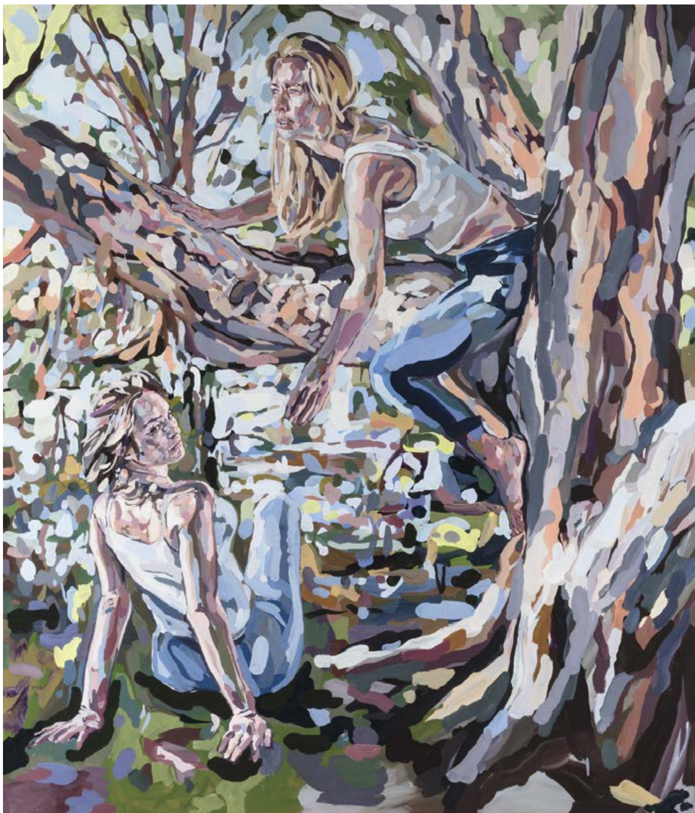
Sweet is the Swamp 2021 acrylic on canvas 213 cm x 183 cm $16,000