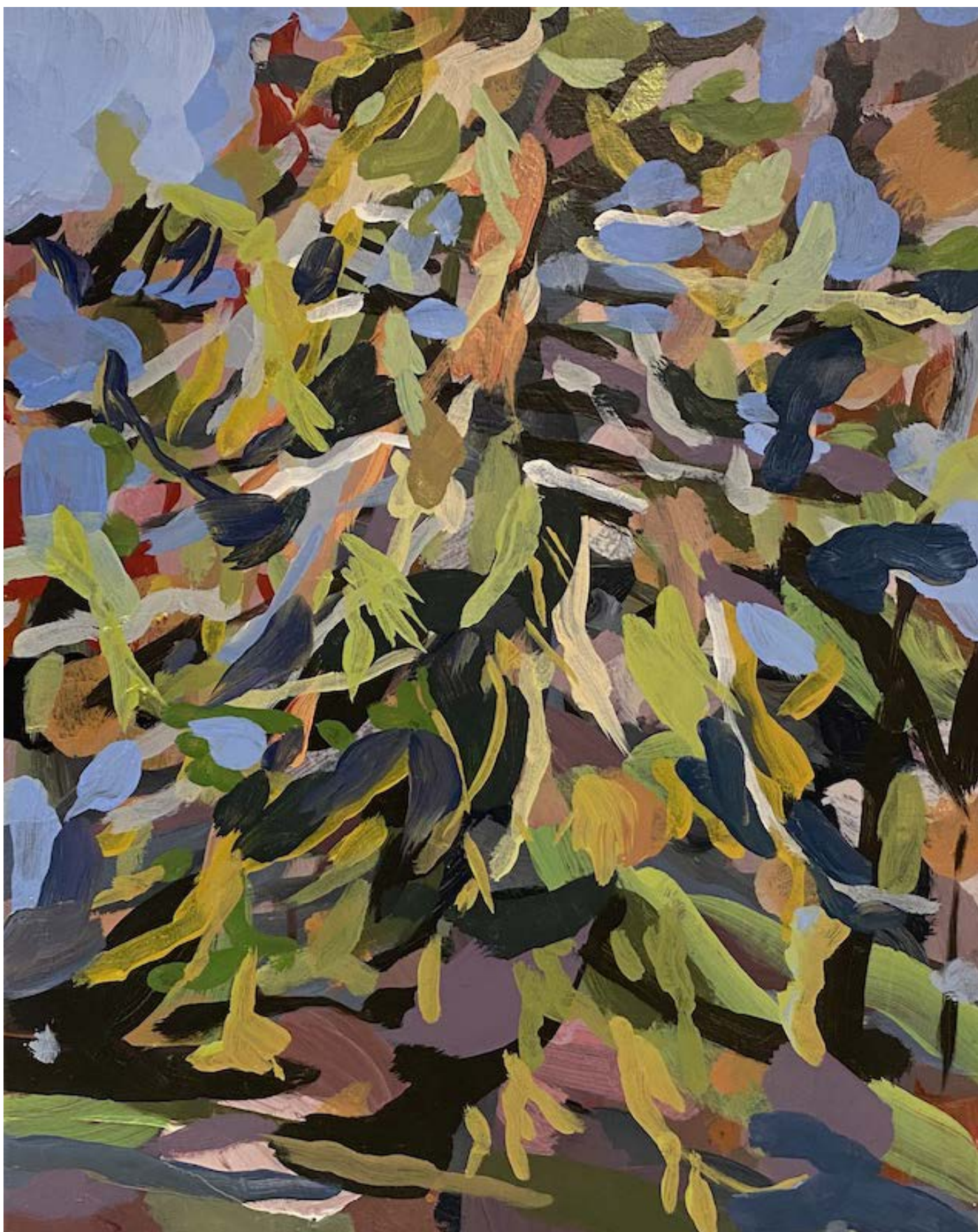
The Bunya Tree 2022 acrylic on canvas 40 cm x 30 cm $4,000