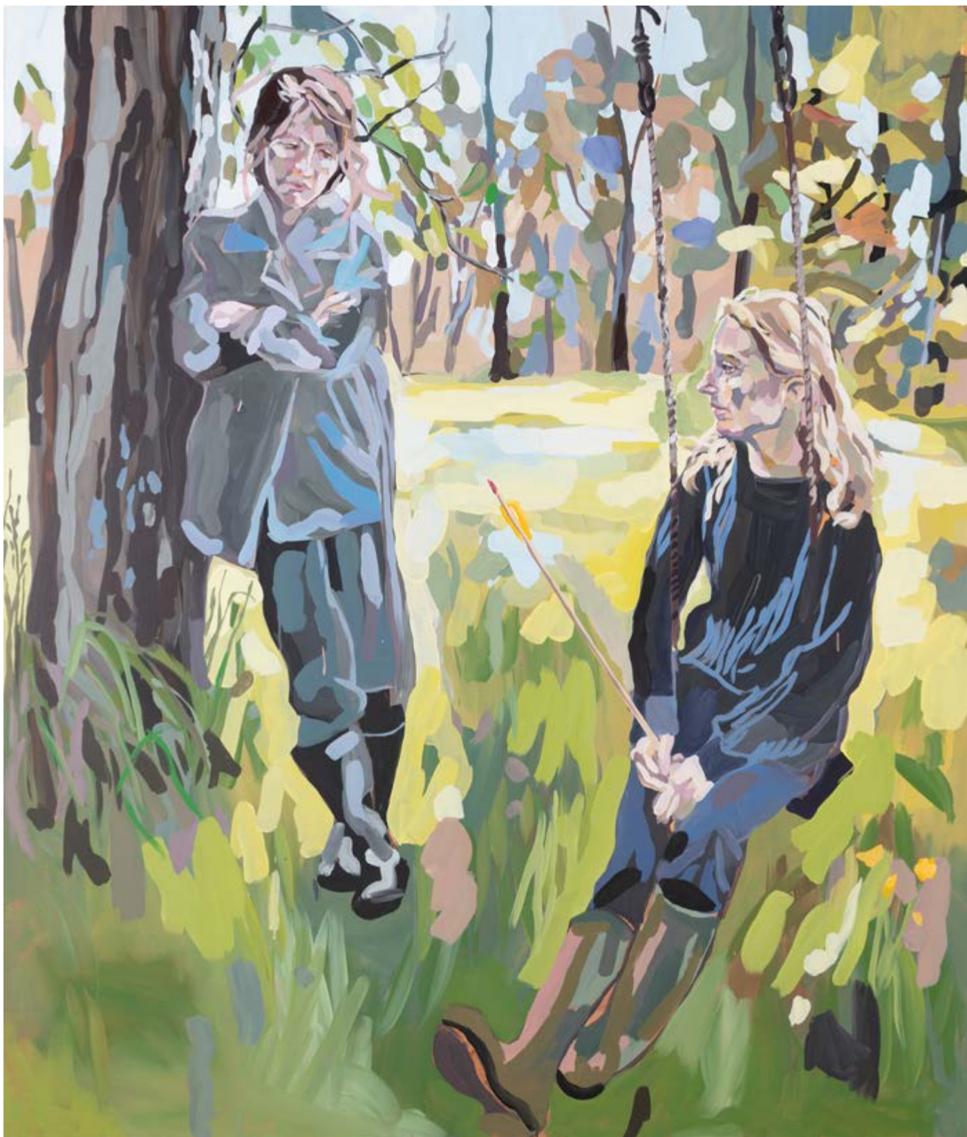
The English Walnut Tree 2022 acrylic on canvas 213 cm x 183 cm $16,000