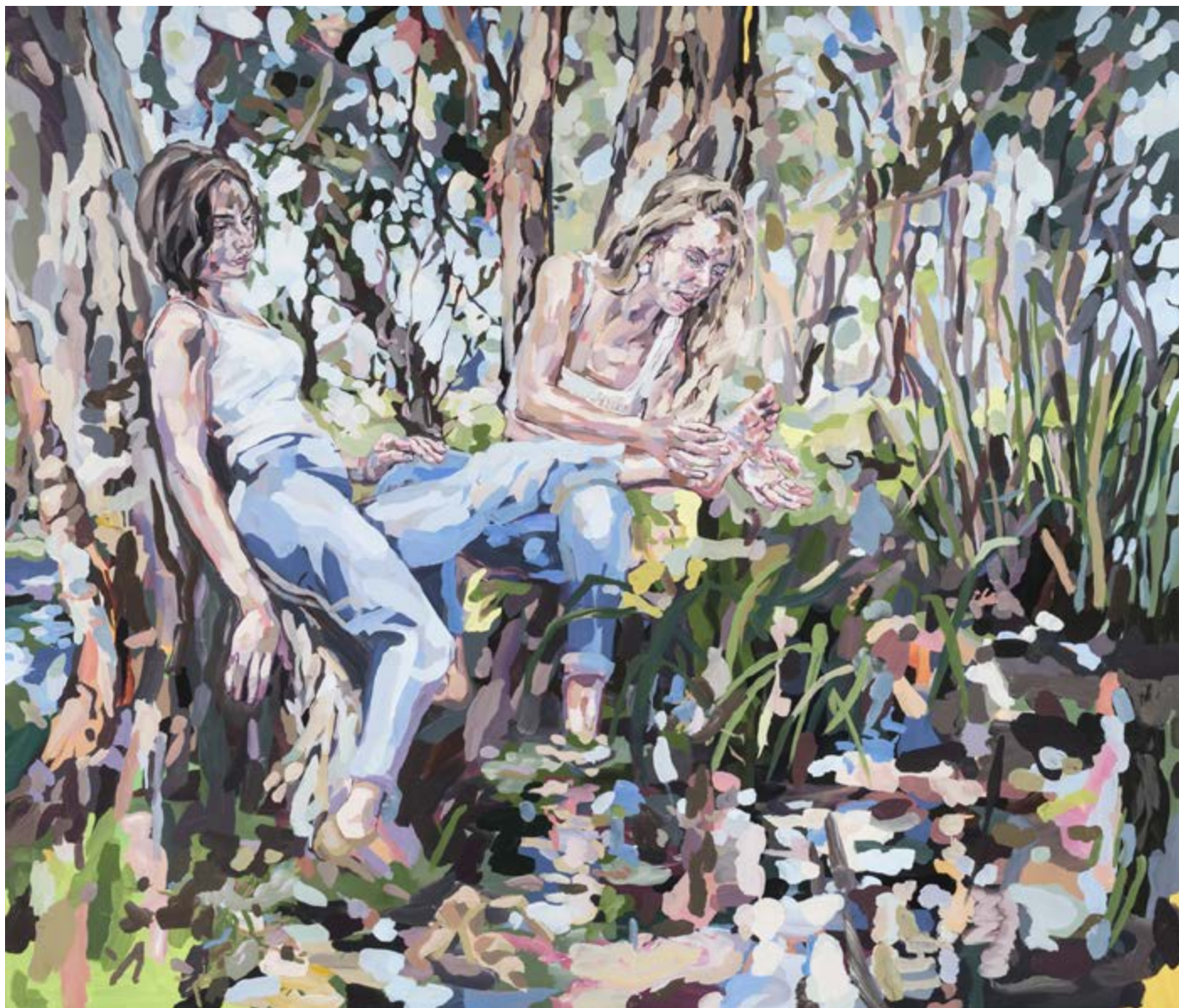
The Thorn 2021 acrylic on canvas 213 cm x 183 cm $16,000