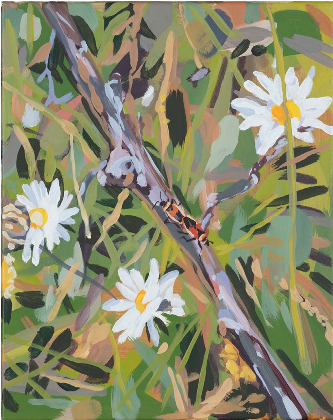
Harlequin Beetles 2022 acrylic on canvas 51 cm x 40 cm (framed) $4,500