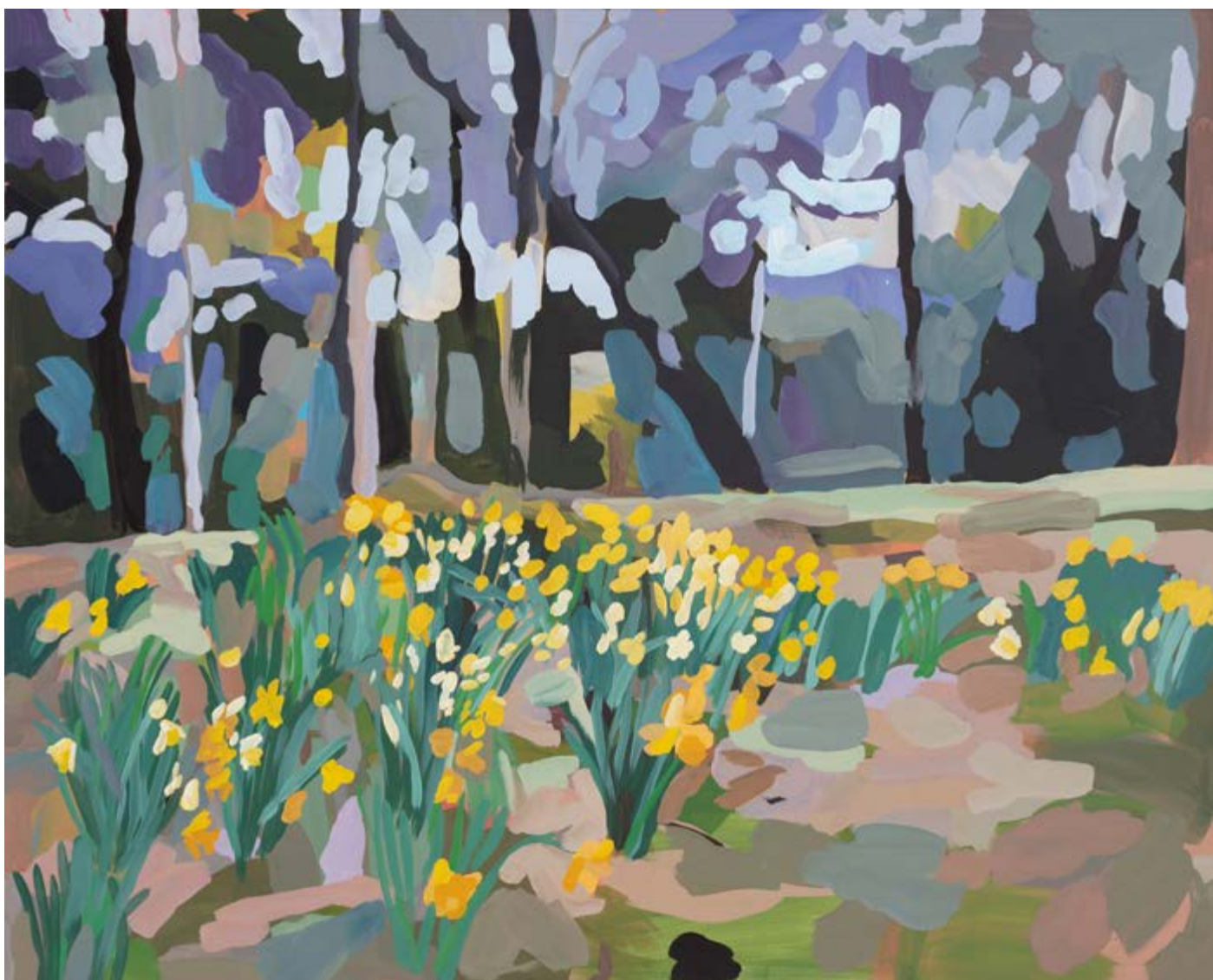
The Old House Daffodils 2022 acrylic on canvas 122 cm x 153 cm $11,000