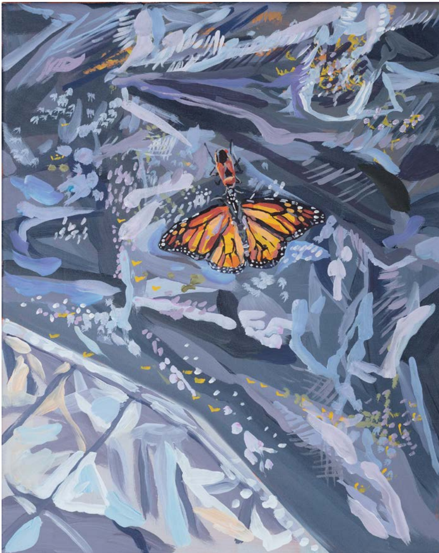
The Butterfly & the Harlequin Beetle 2022 acrylic on canvas 51 cm x 40 cm (framed) $4,500