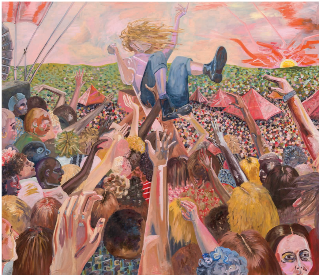
Above Crowd Surfing 2019 oil on linen 213 x 183cm