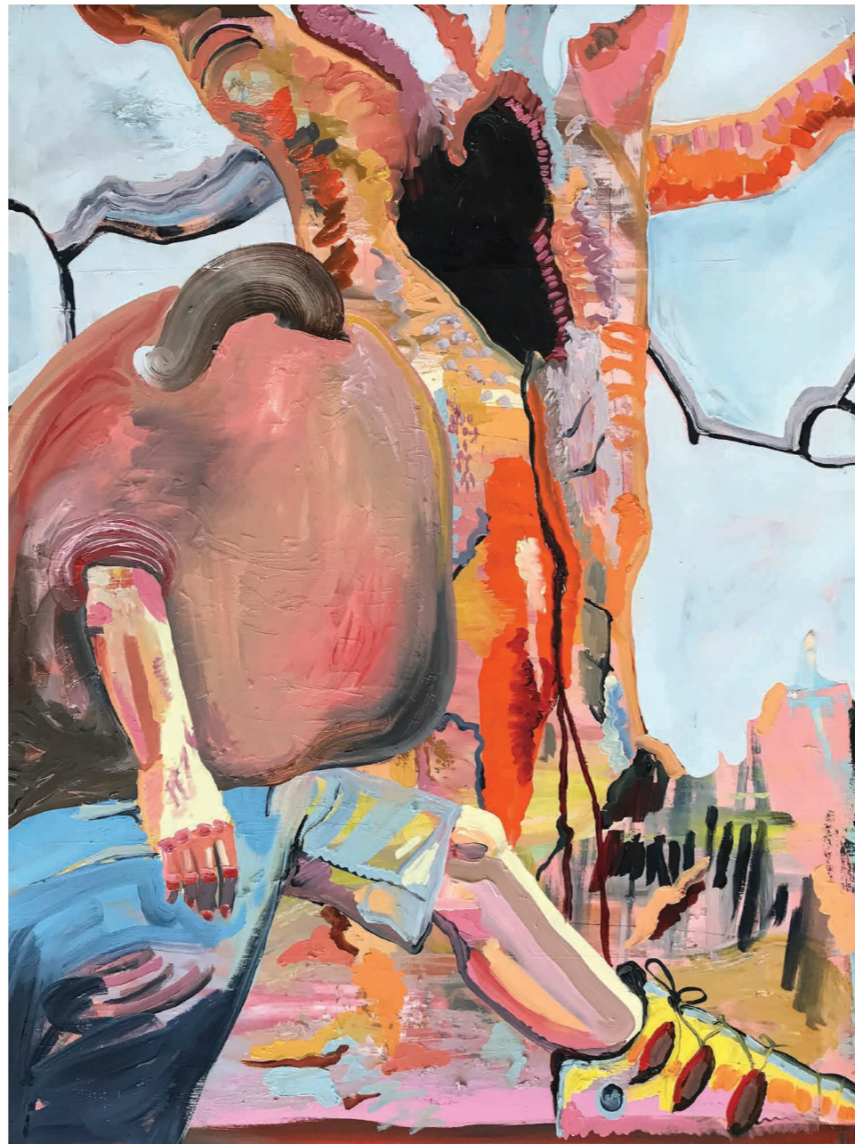
Above Psychedelic Hike 2018 oil on polyester 71 x 91cm