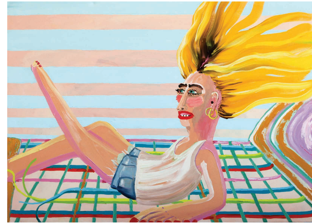
Right Blond on Lawnchair 2016 oil on canvas 91 x 121cm