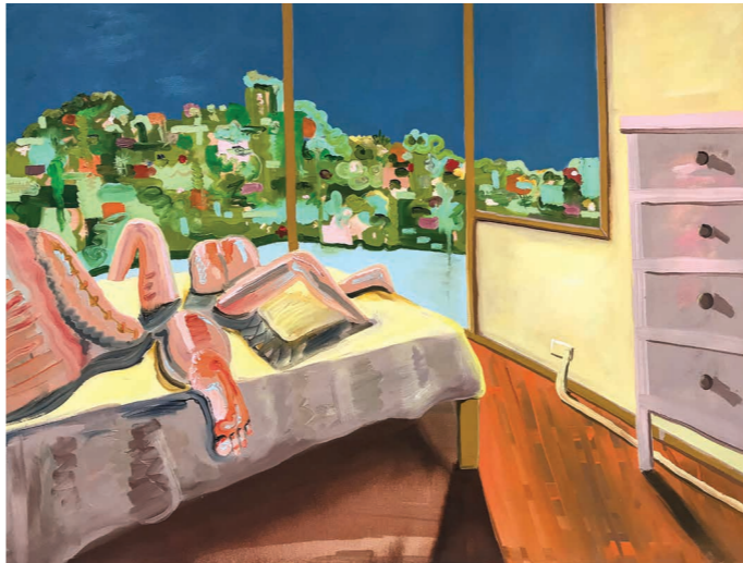
Right Saturday Morning Modernism 2018 oil on canvas 91 x 122cm