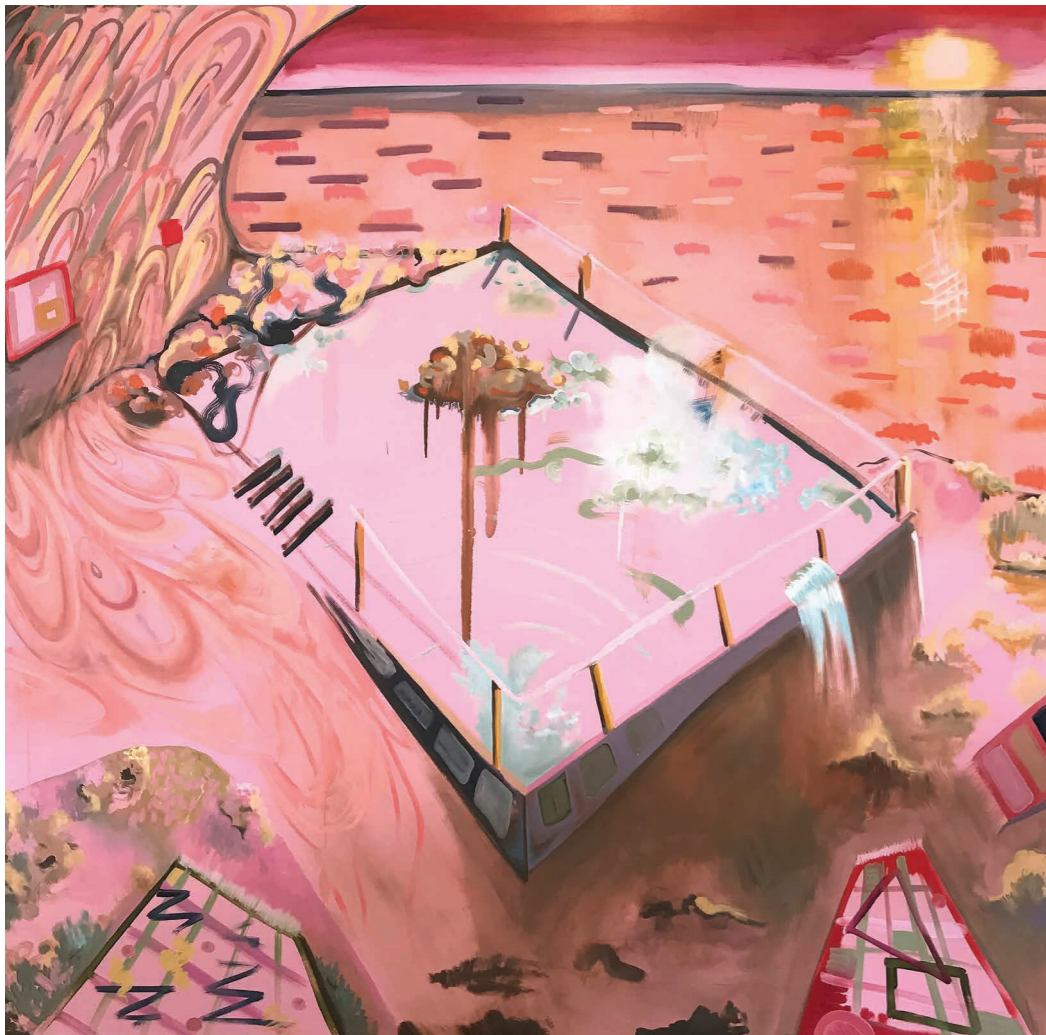
Above North Curl Curl Rock Pool 2019 oil on belgian linen 183 x 183cm