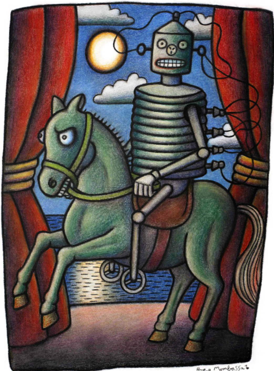
Robot riding a horse.