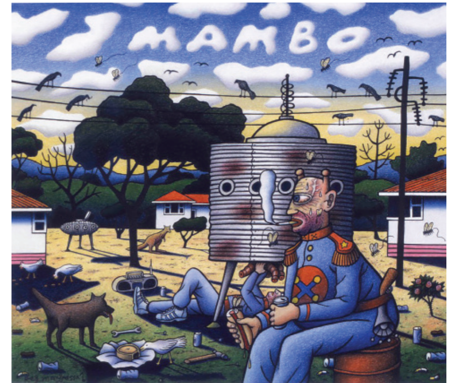
Left Replacing a differential, South Western NSW 2001 Charcoal and coloured pencil on paper 45 x 52cm