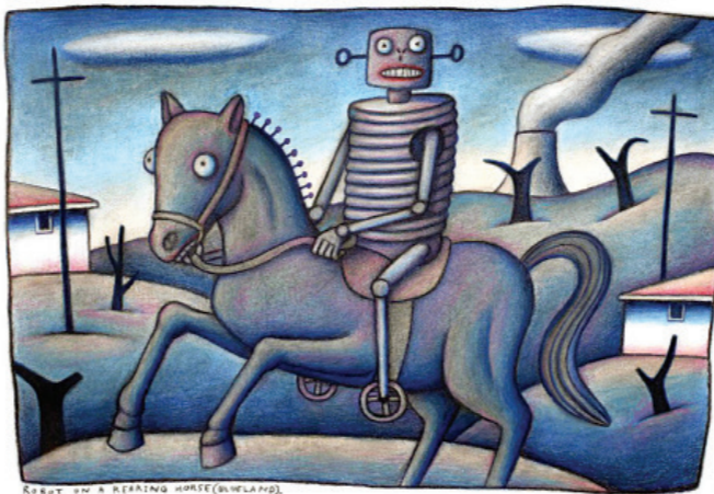
ROBOT ON A REARING HORSE (BLUELAND) Reg Mombassa