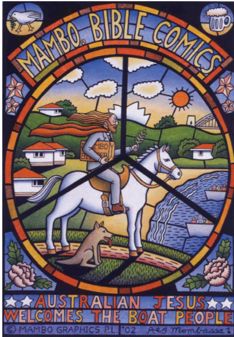
Above Australian Jesus welcomes the Boat People 2004 Charcoal and coloured pencil on paper 38 x 29cm