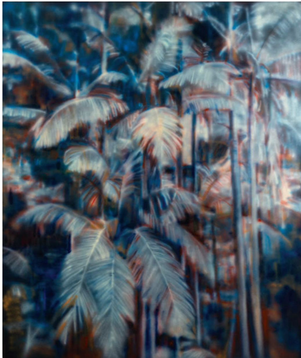
Above The unquiet 2018 Acrylic on canvas 198 x 167.5 cm