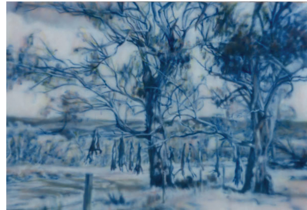
Right Beneath this dry land 2016 Acrylic on canvas 198 x 137 cm