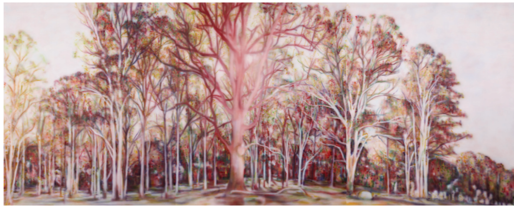
Above A rain of falling cinders 2015 Acrylic on canvas 198 x 504 cm (triptych)