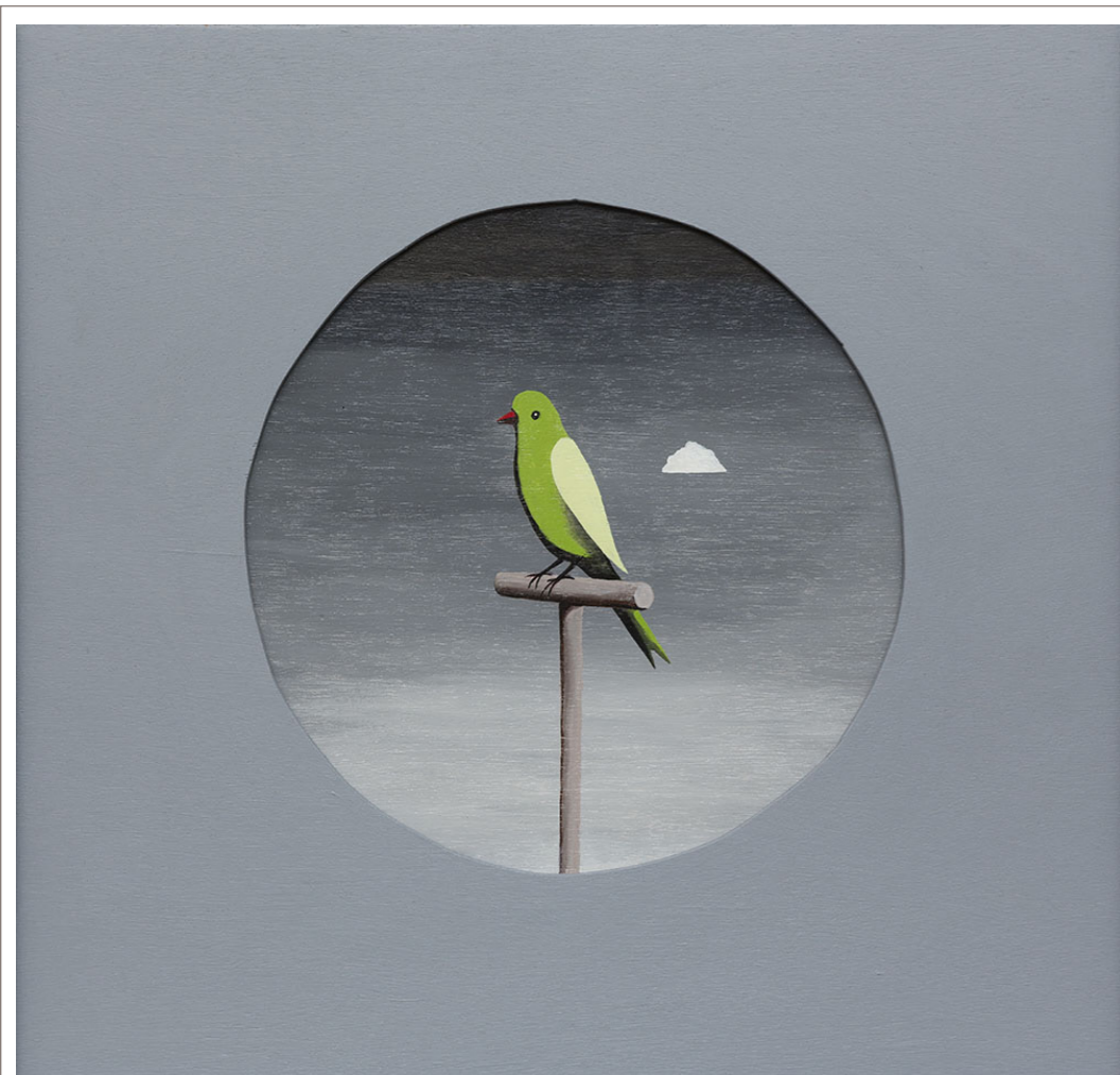
Above Green Bird 2003 enamel on board 61.5 x 70 cm