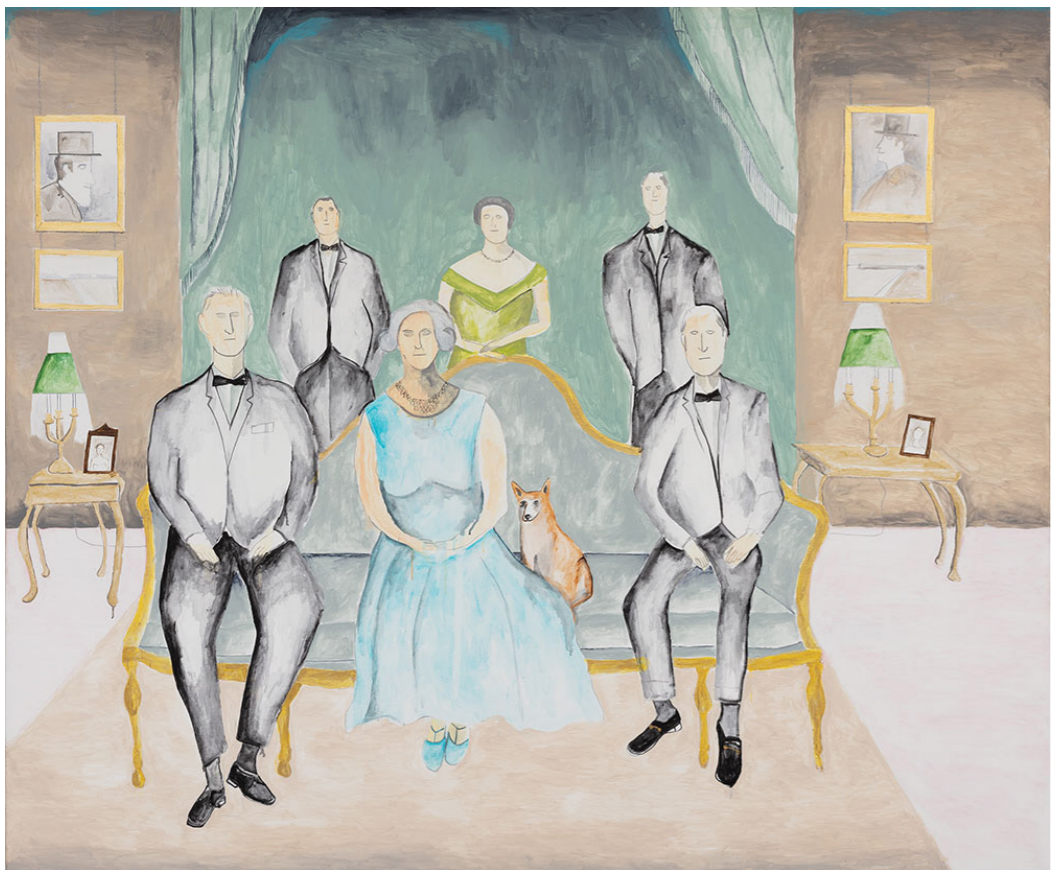
Above The Royal Family 2011 acrylic on canvas 150 x 180 cm