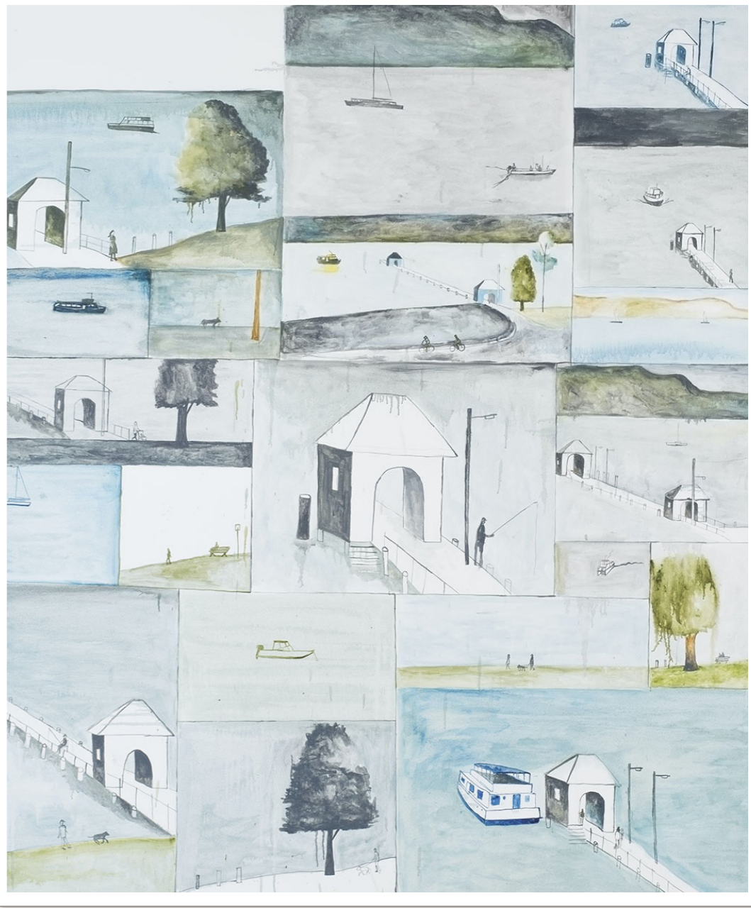
Above Wharf, Palm Beach 2014 oil on canvas 180 x 150 cm