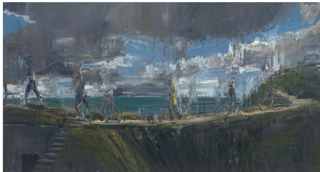
Above Mornington Peninsula 2017 Oil on polyester 122 x 216cm