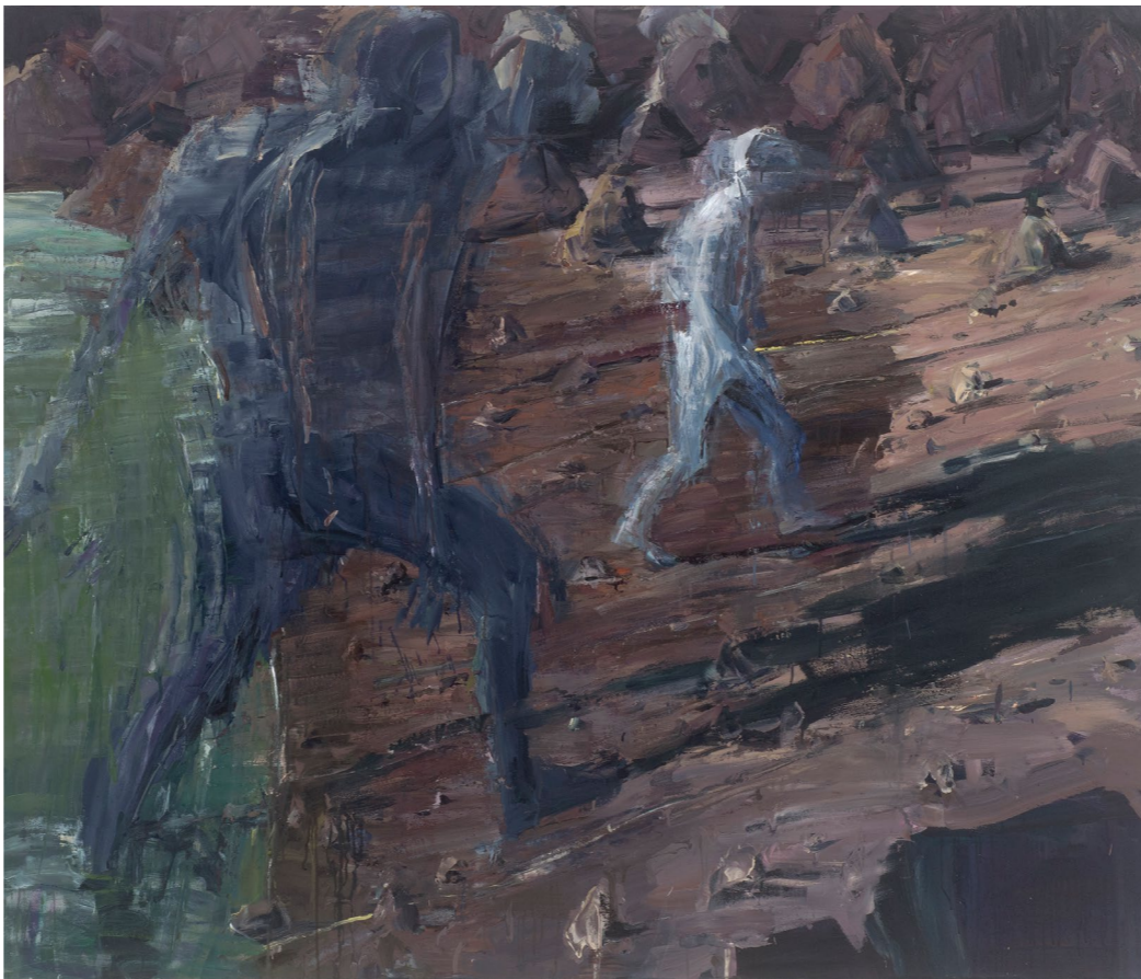
Above Diamond Harbour 2017 Acrylic on polyester 150 x 180cm