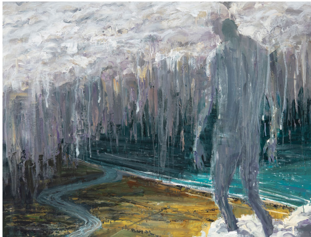
Above Cloudman 2018 Oil and acrylic on polyester 150 x 180cm

Artworks courtesy of Euan Macleod Euan Macleod appears courtesy of Watters, Sydney and Niagara, Melbourne.