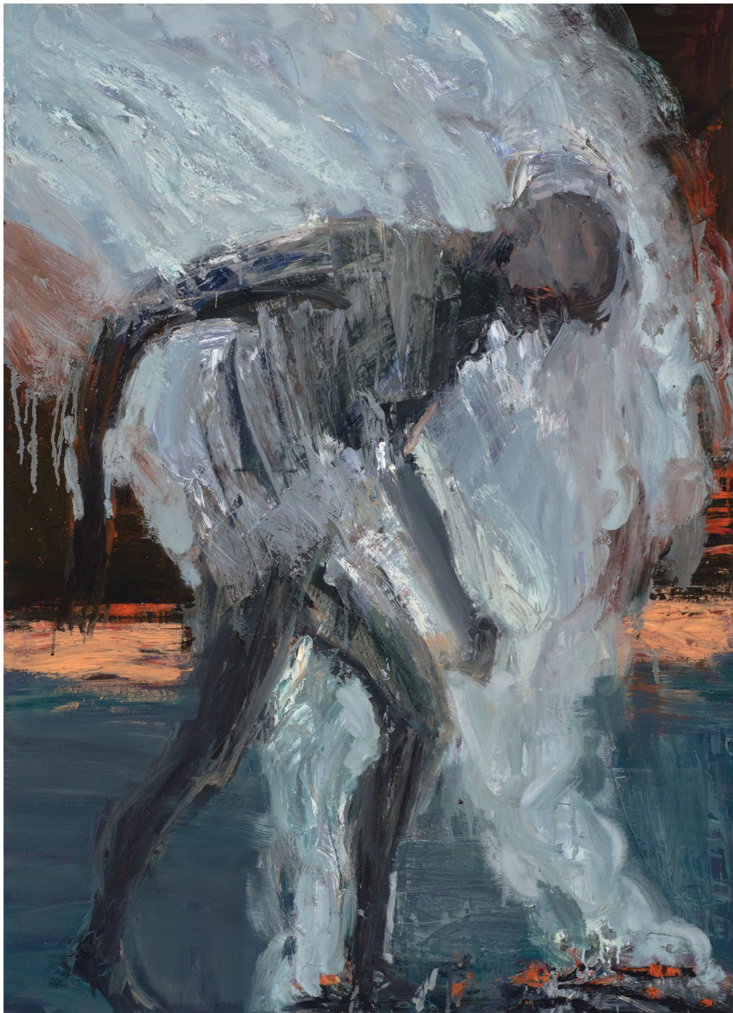
Above Lighting Fire (Christian) 2014 Oil and acrylic on polyester 120 x 84cm