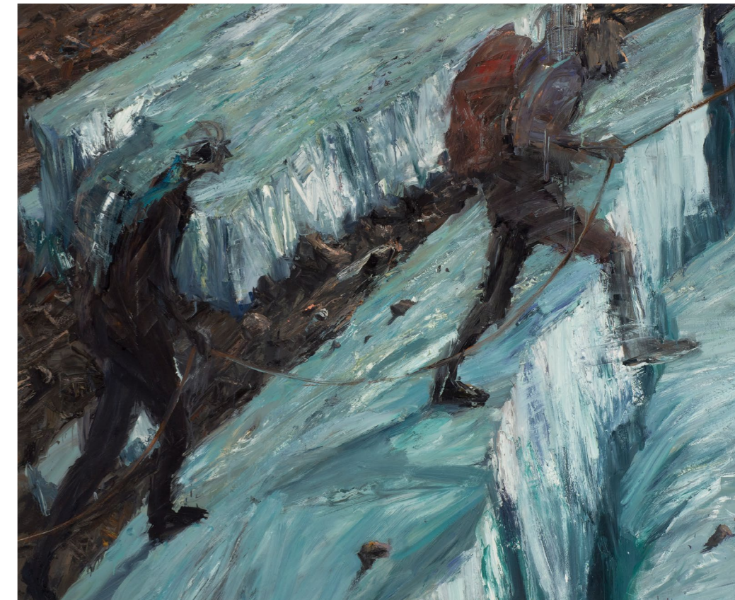
Above Stepping Across Crevasse 2012 Oil on polyester 150 x 180cm