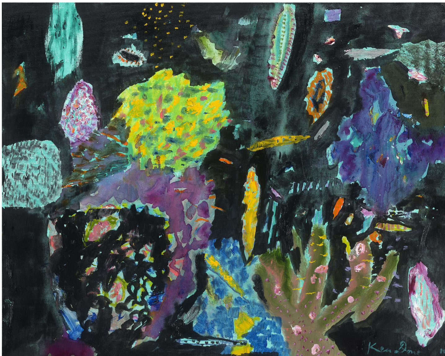
Night reef I 2019 oil and acrylic on linen 82 cm x 102 cm $14,000