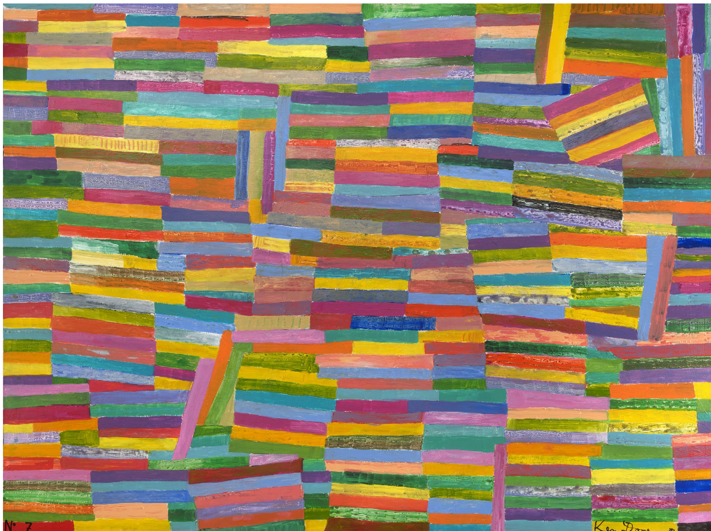
No. 7 2020 oil on linen 183 cm x 244 cm $50,000