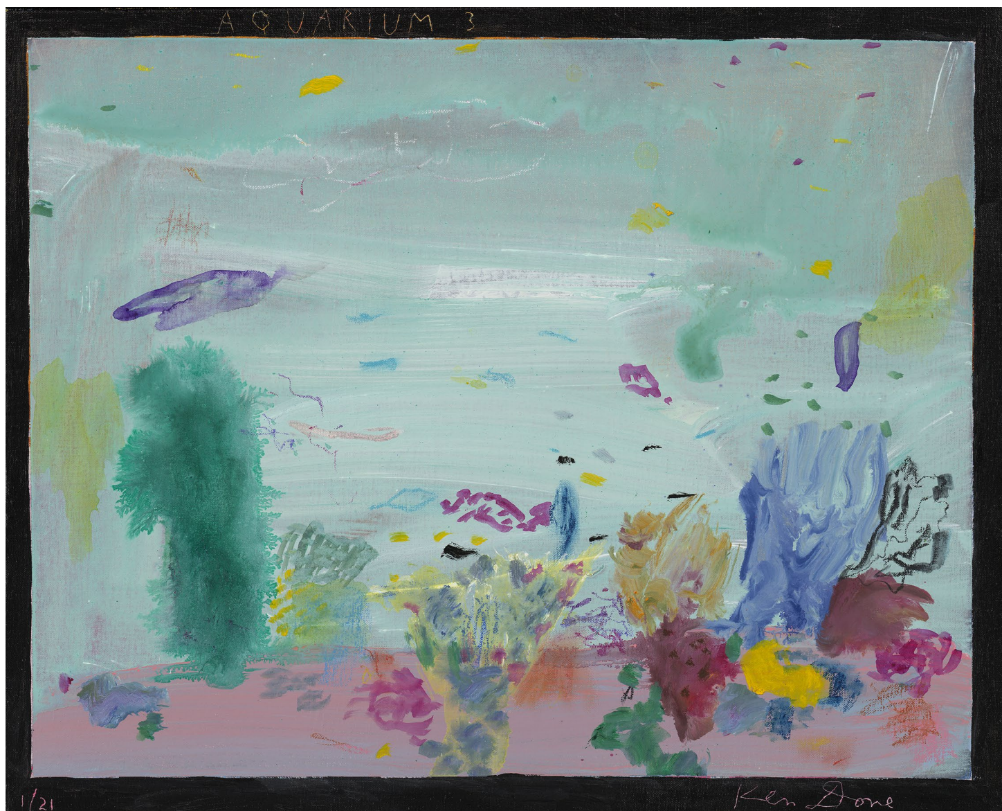
Aquarium 3 1/2021 oil on linen 41 cm x 51 cm $5,500