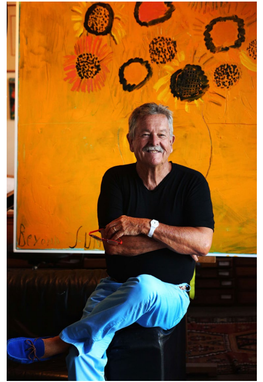
Artworks courtesy of Ken Done Ken Done is represented by The Ken Done Gallery

In 1992, Ken received the Order of Australia (A.M.), for services to Art, Design and Tourism. In many parts of the world, Ken Done has come to symbolise Australia and Australians: creative, optimistic and bold.