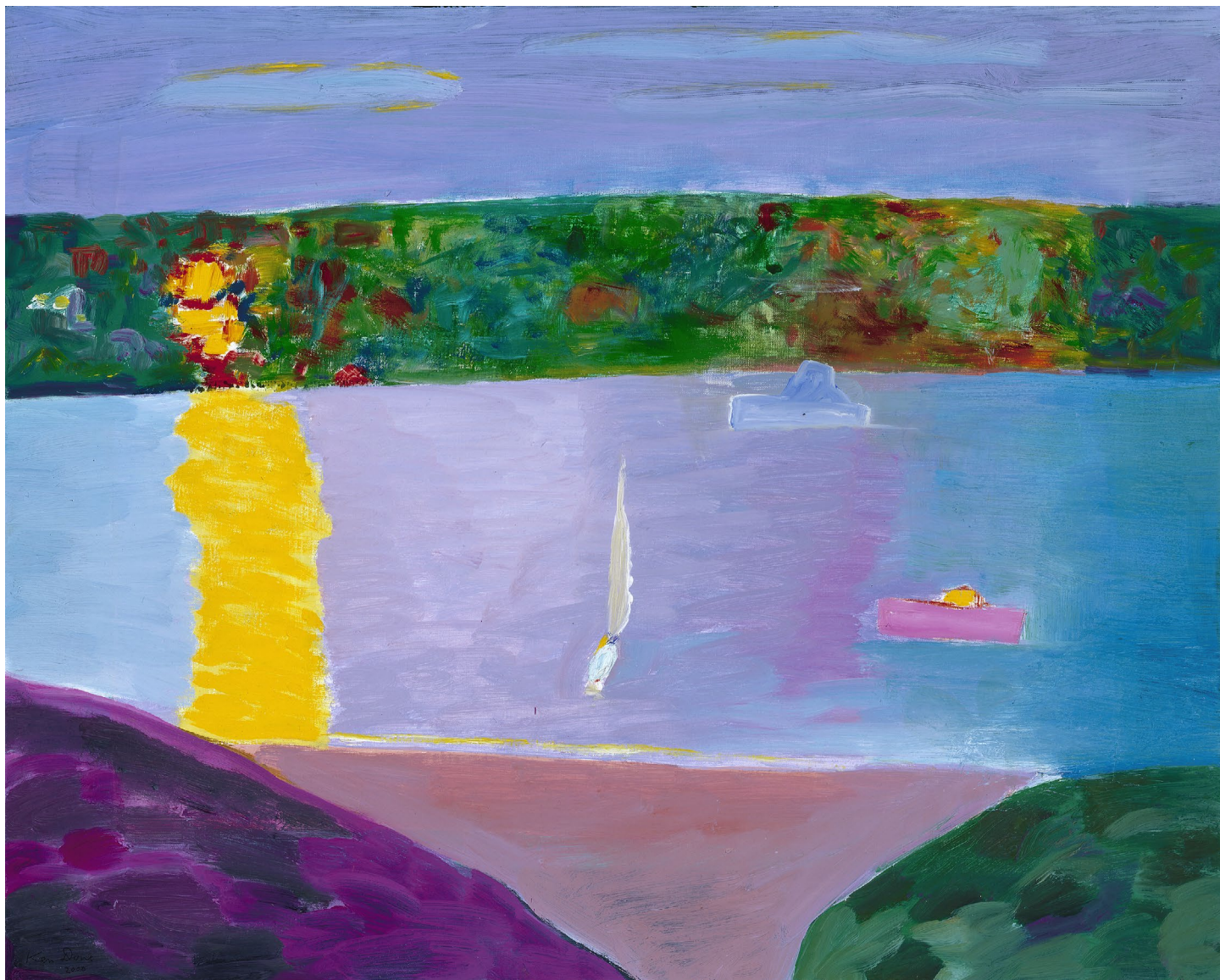
Last light 2000 oil on canvas 60 cm x 75 cm $8,000