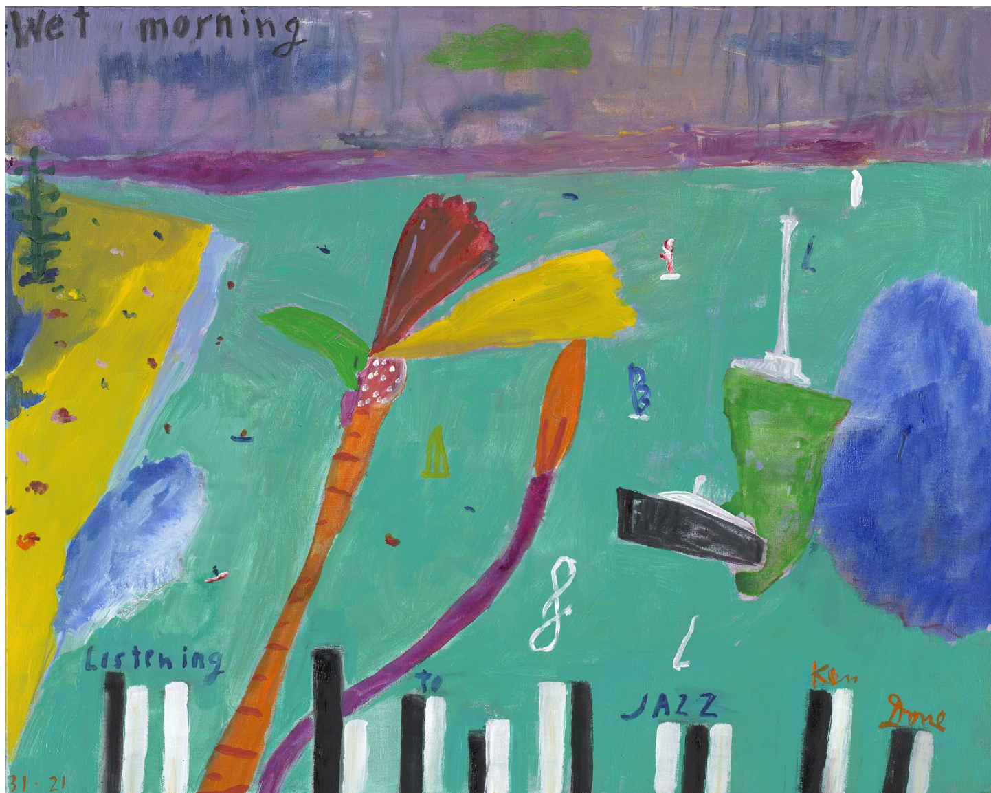
Wet morning listening to jazz 2022 oil and acrylic on linen 82 cm x 102 cm $14,000