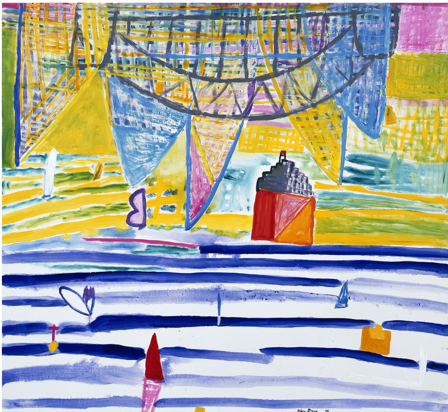
Opera House, city and harbour III 1998 acrylic on canvas 168 cm x 183 cm $45,000