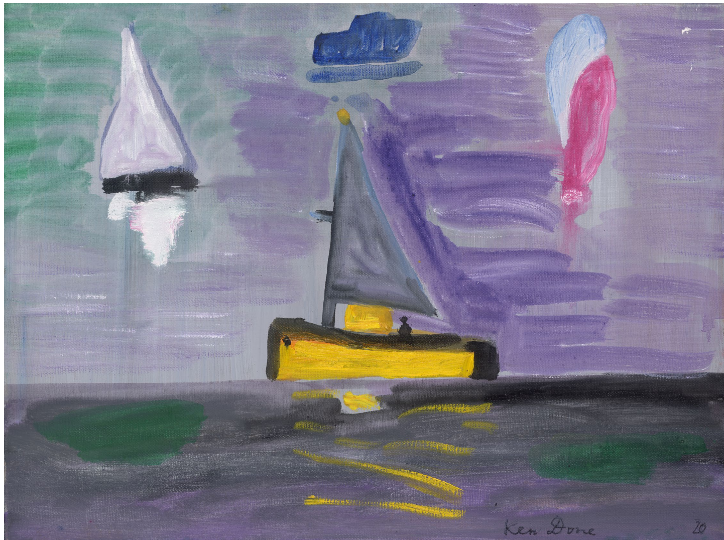
Yellow boat 2020 oil and acrylic on linen 30 cm x 40 cm $4,500