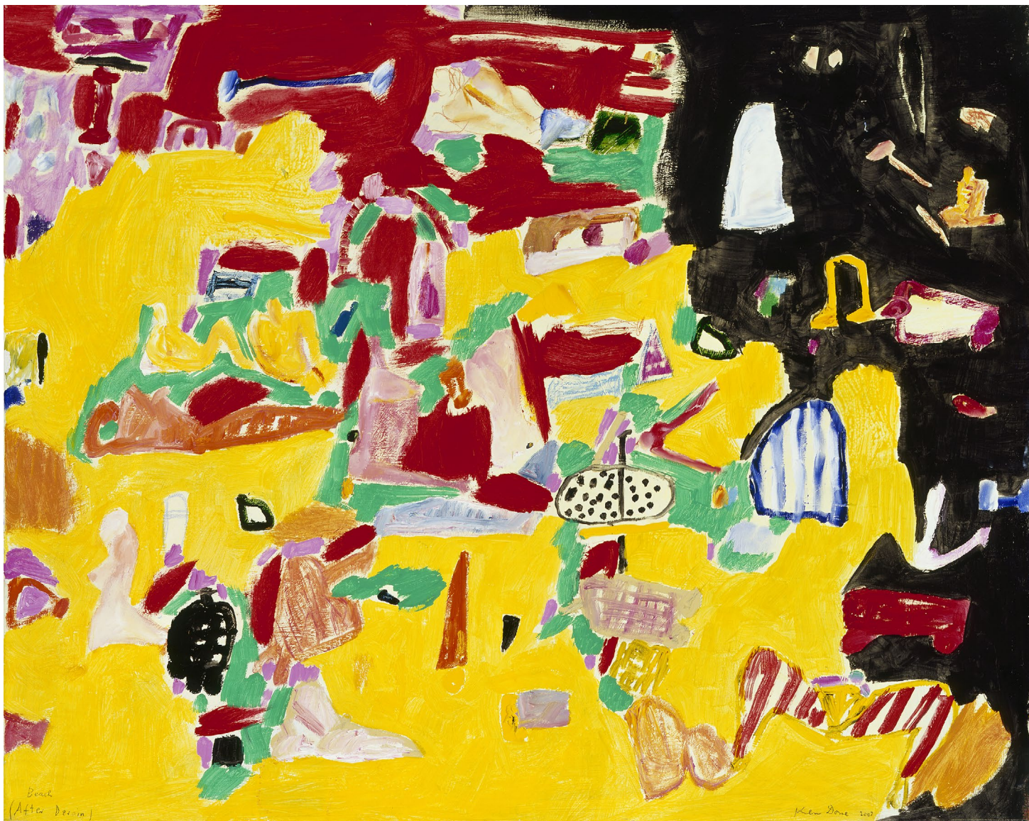
Beach (after Derain) 2003 oil and acrylic on canvas 80 cm x 100 cm $14,000