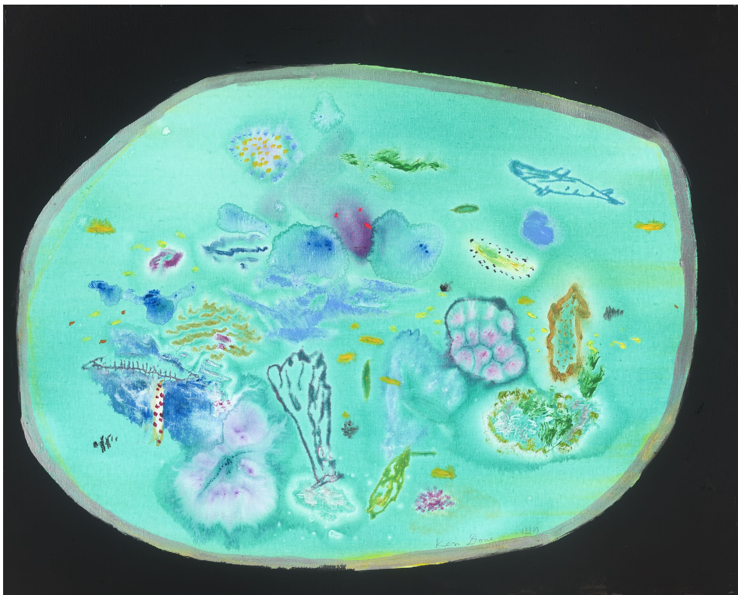
Mask 2019 acrylic and oil crayon on linen 82 cm x 102 cm $12,500