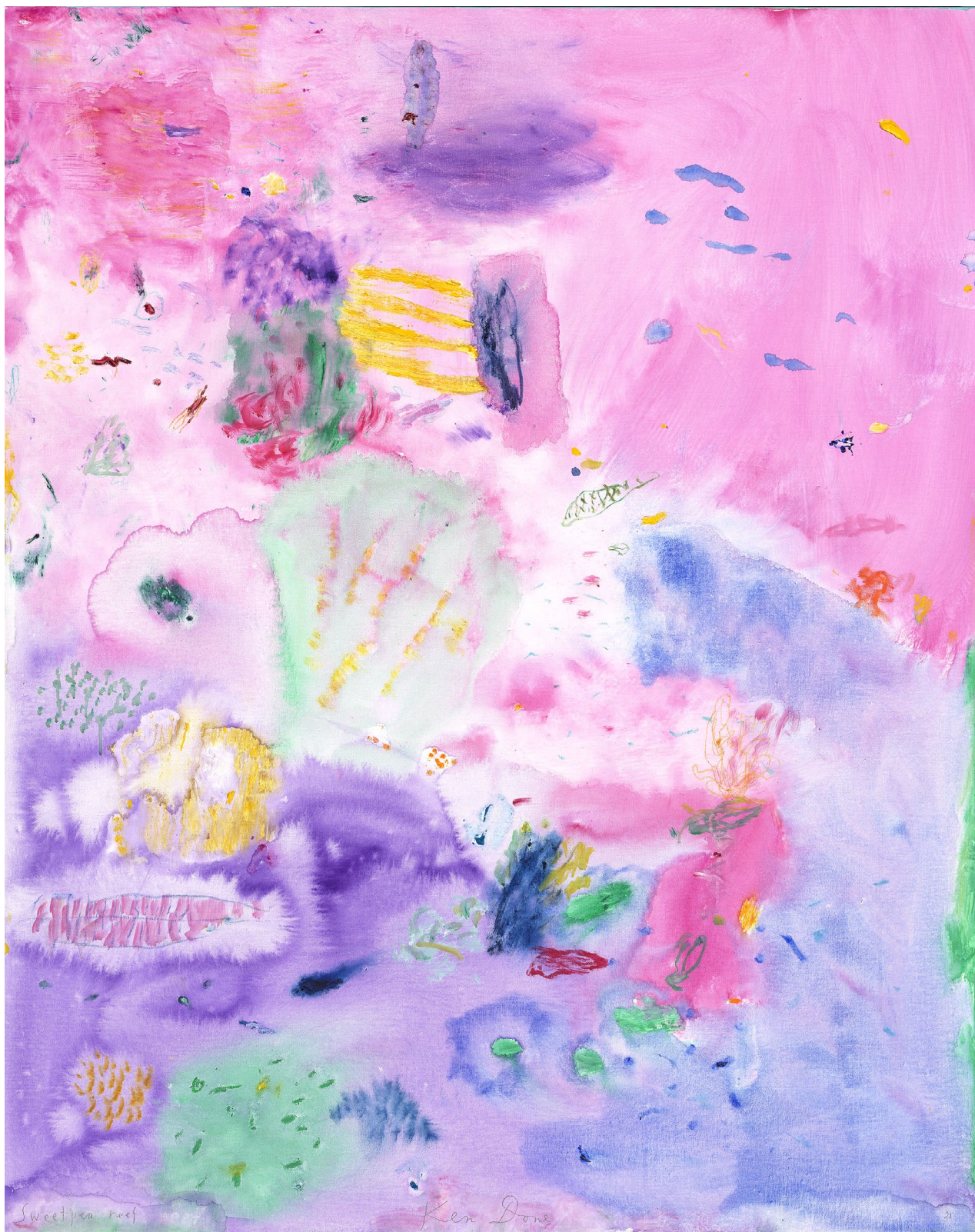
Sweetpea reef 2021 oil and acrylic on linen 152 cm x 122 cm NFS