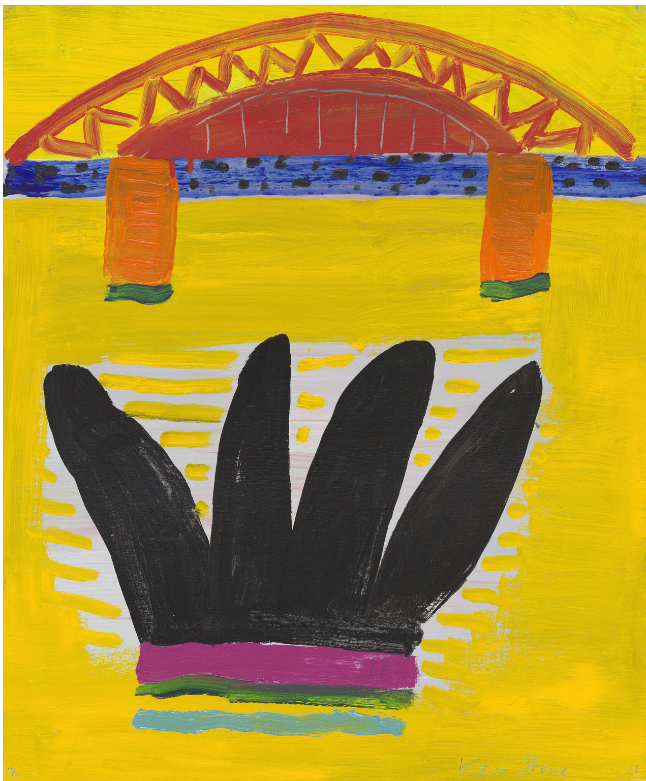
Sydney Xmas 2021 oil and acrylic on linen 61 cm x 51 cm $6,500