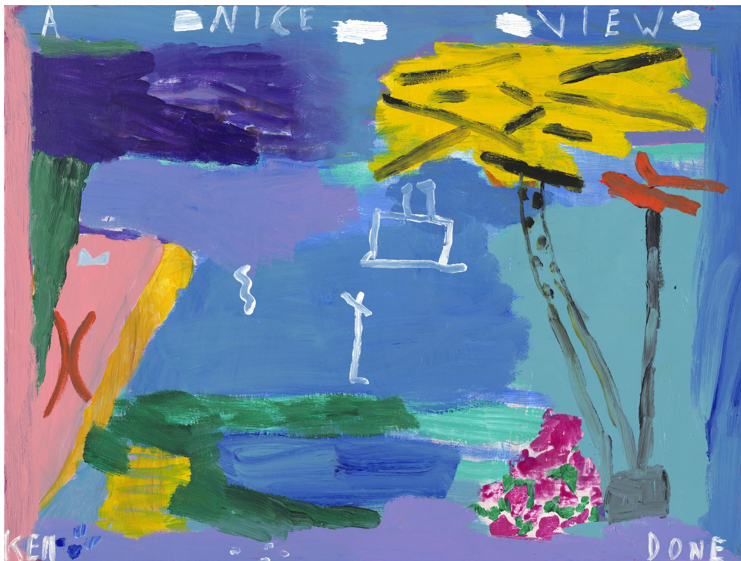
A nice view 2 2021 oil and acrylic on linen 82 cm x 102 cm $14,000