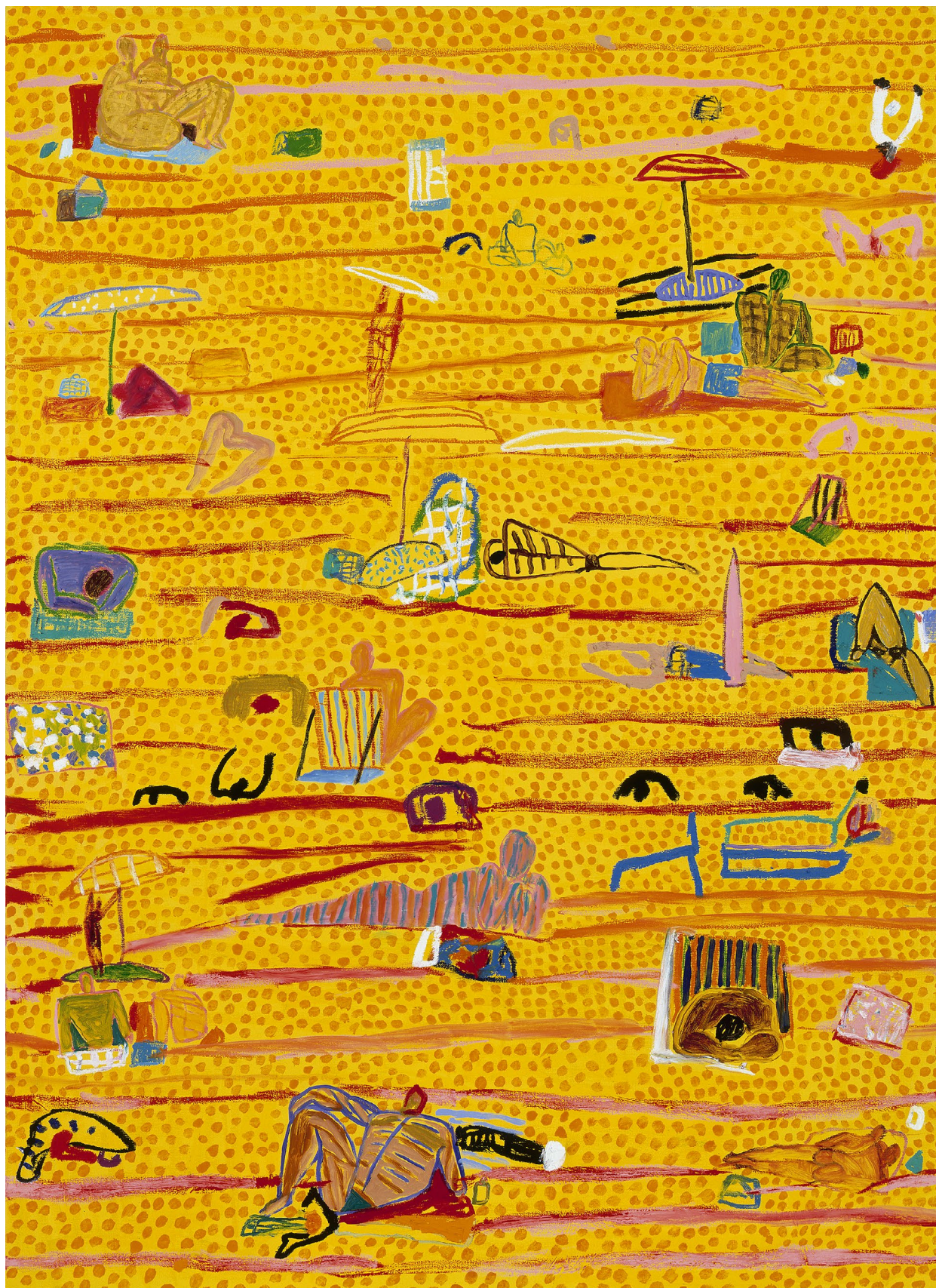
Between the flags II 1996 enamel, acrylic and oil crayon on canvas 213 cm x 153 cm $70,000