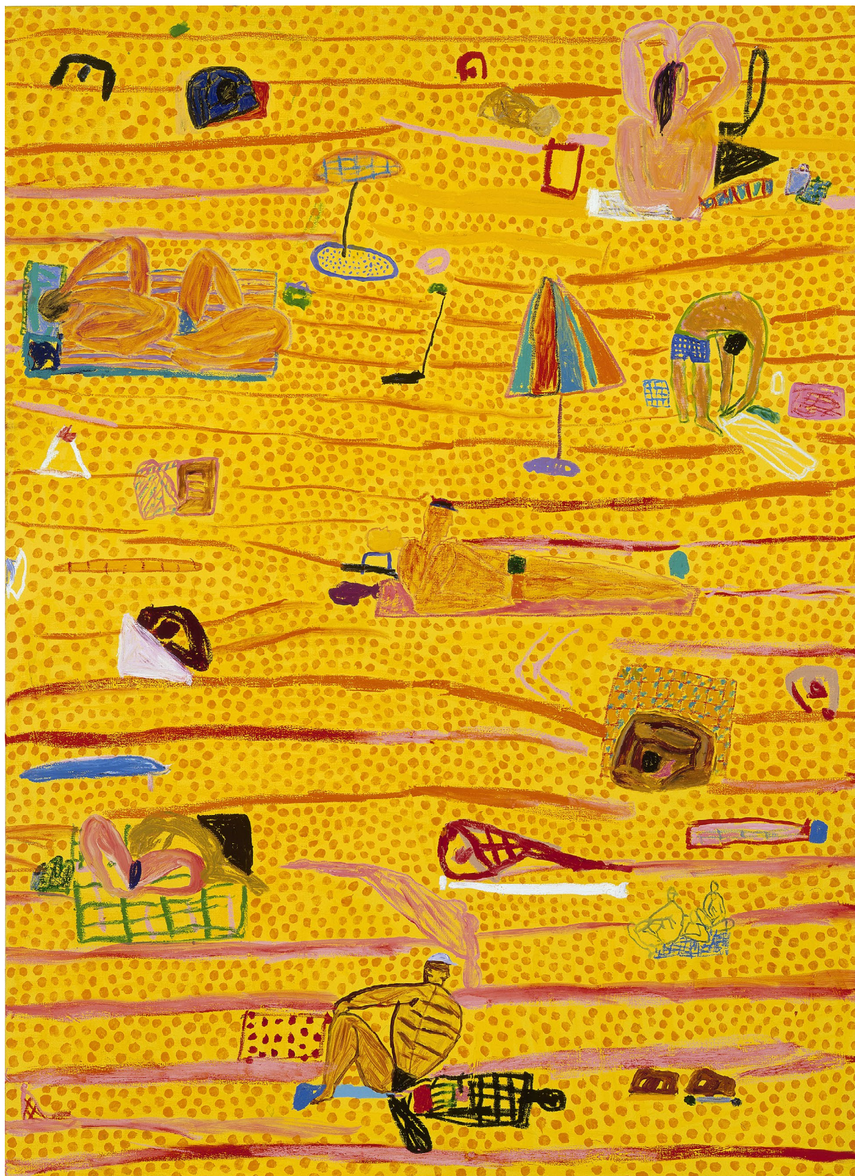
Between the flags III 1996 enamel, acrylic and oil crayon on canvas 213 cm x 153 cm $70,000