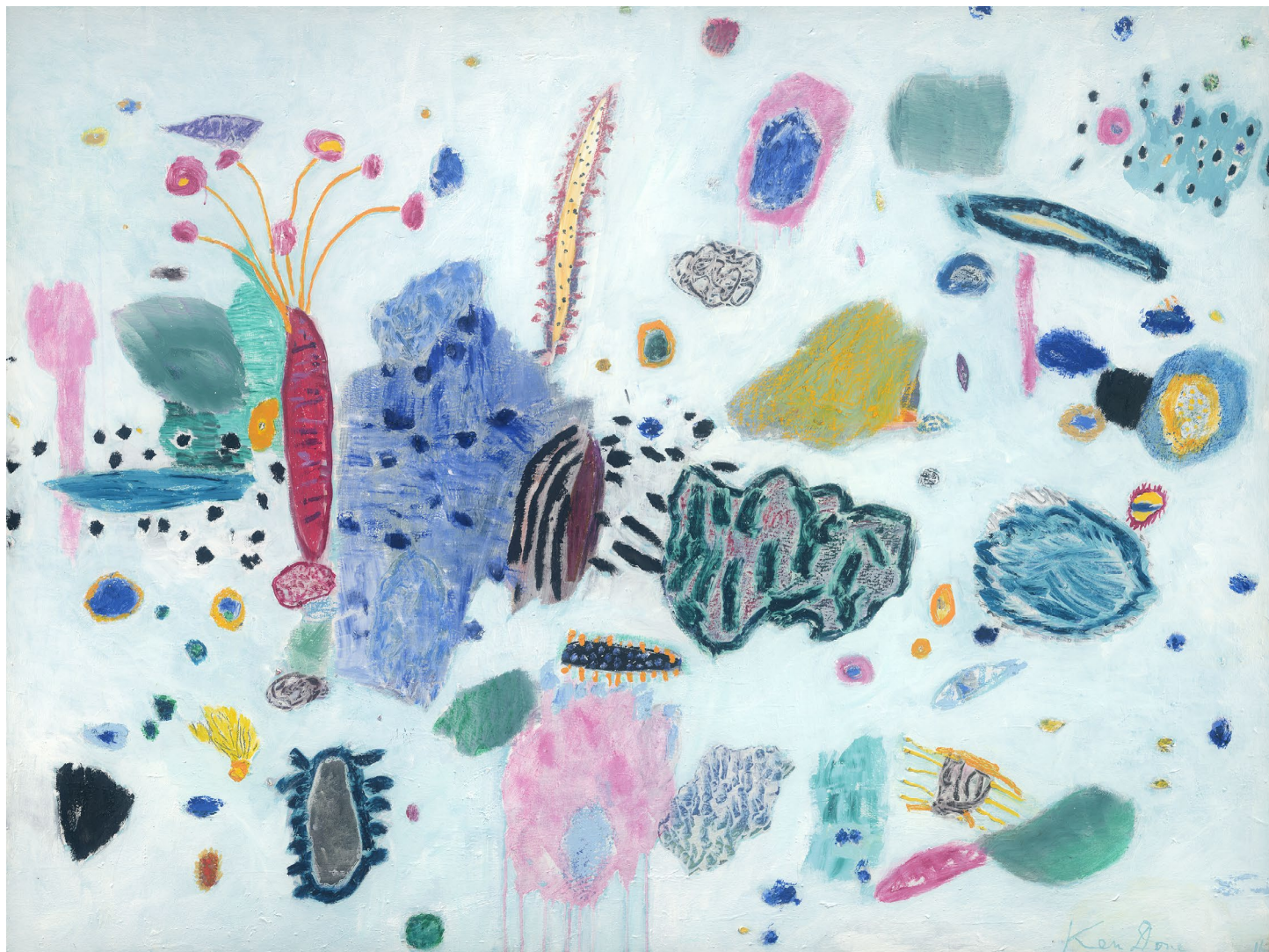
Dr White reef 2016 oil and acrylic on linen 183 cm x 244 cm $55,000