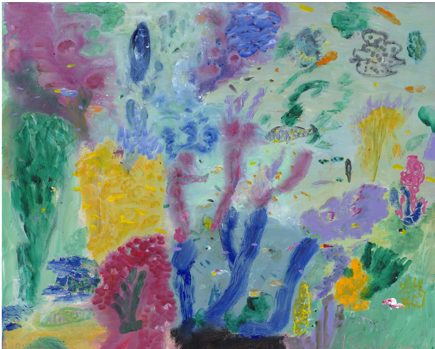
Aqua reef 2021 oil and acrylic on linen 82 cm x 102 cm $13,000