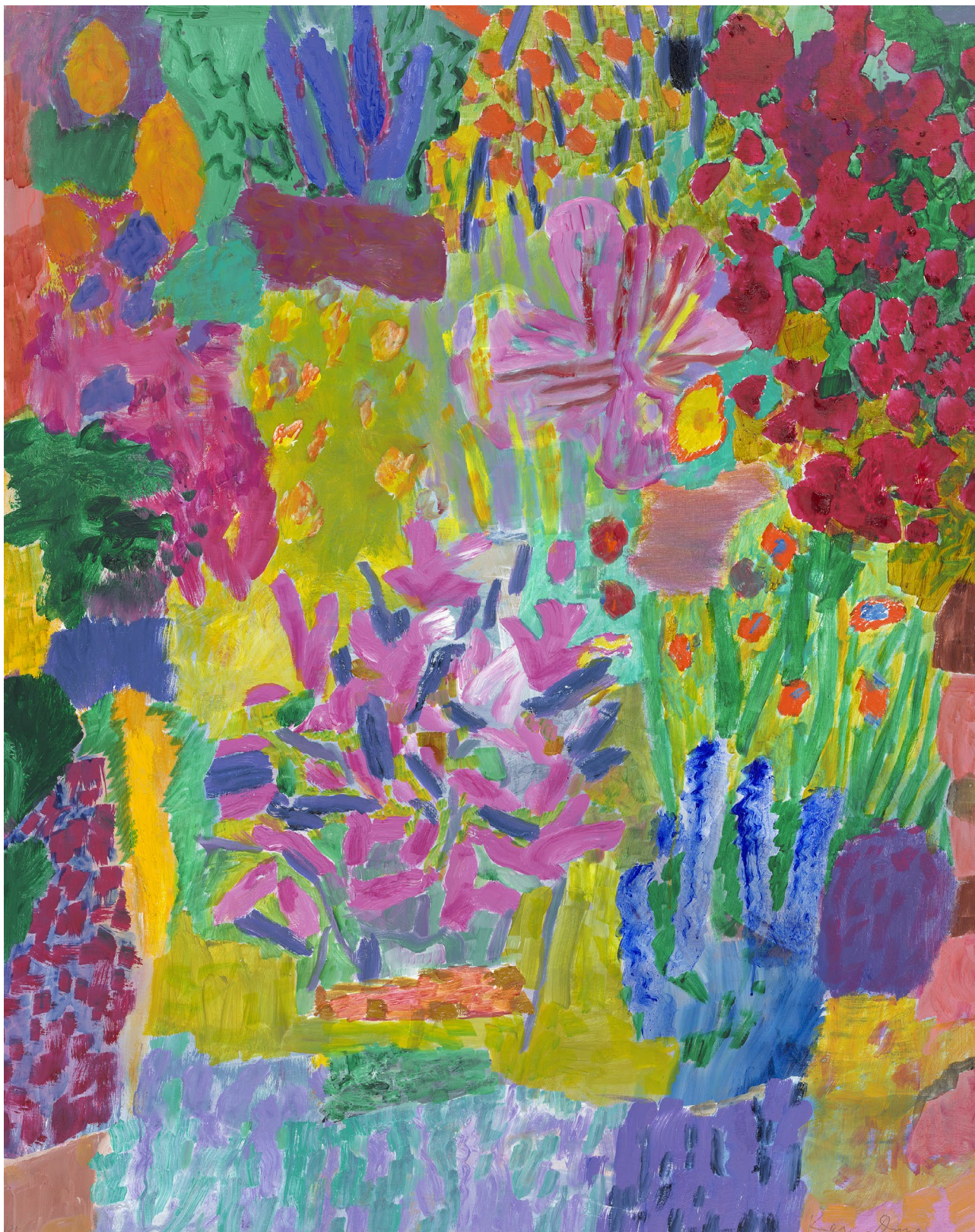
Garden 1 2021 oil and acrylic on linen 152 cm x 122 cm $38,000