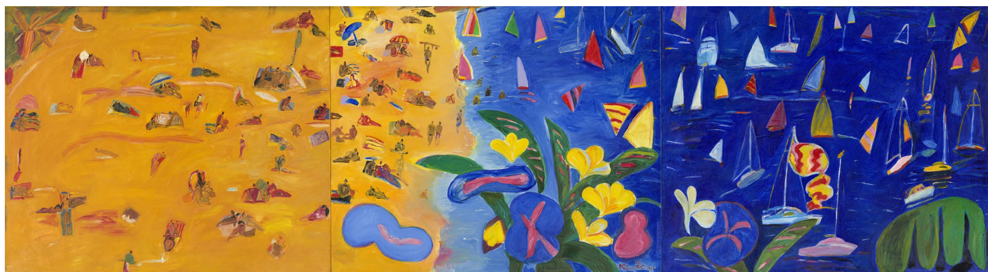
Beach triptych 1986 oil on 3 canvas panels each 90 cm x 110 cm NFS