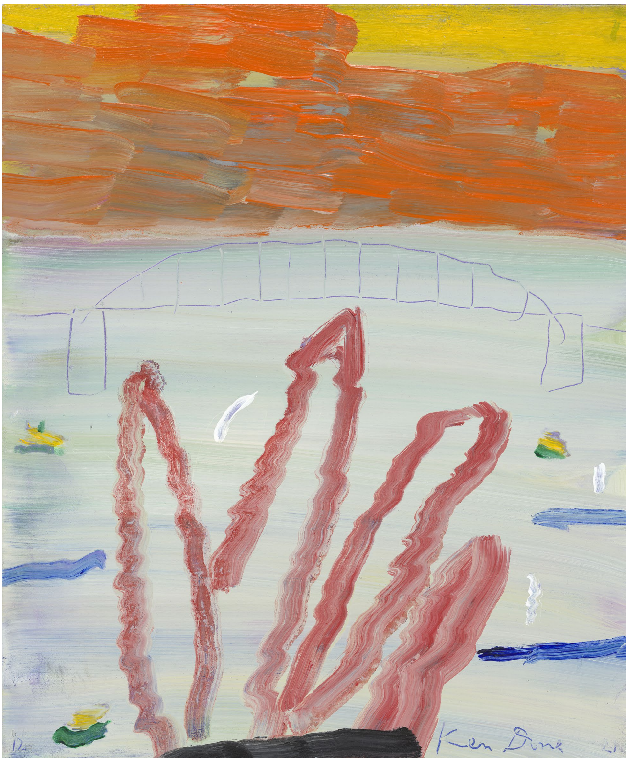
Sydney heatwave 2021 oil and acrylic on linen 61 cm x 51 cm $6,500