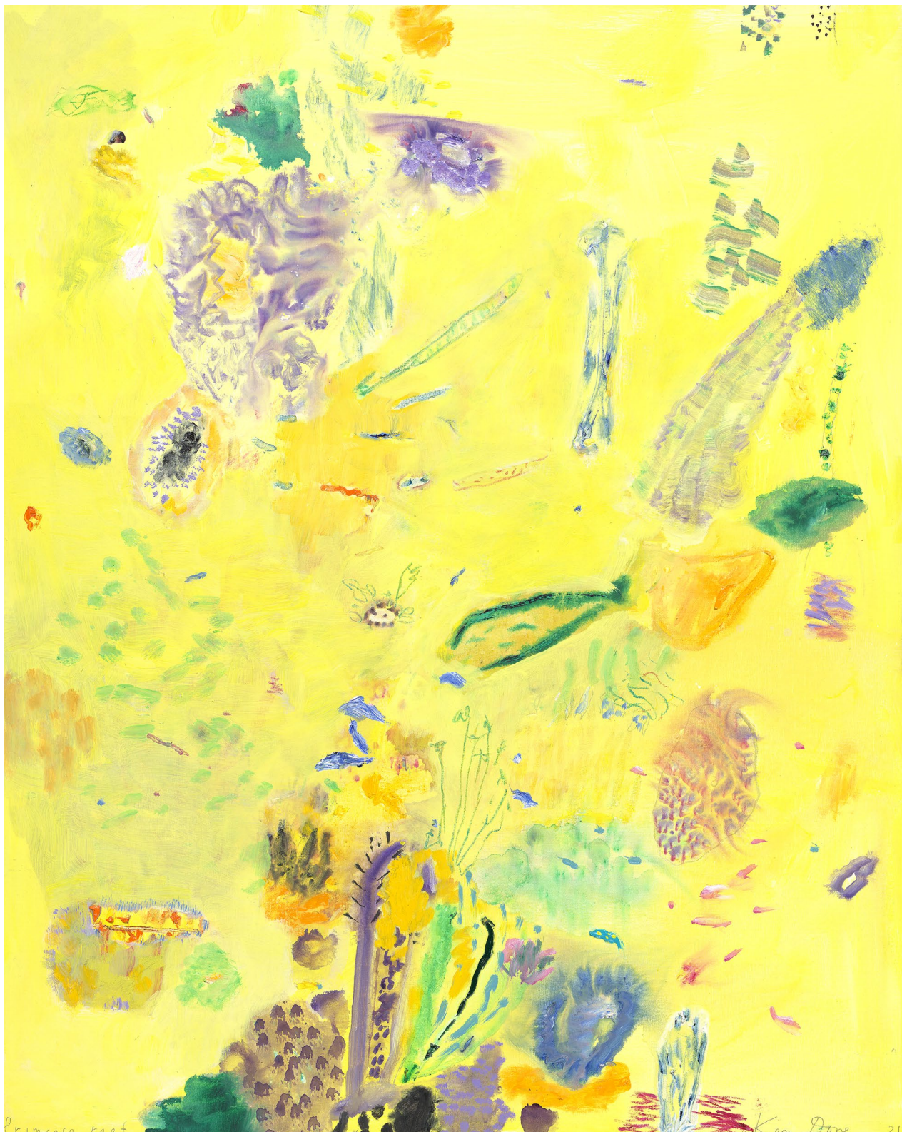
Primrose reef 2021 oil and acrylic on linen 152 cm x 122 cm $32,000