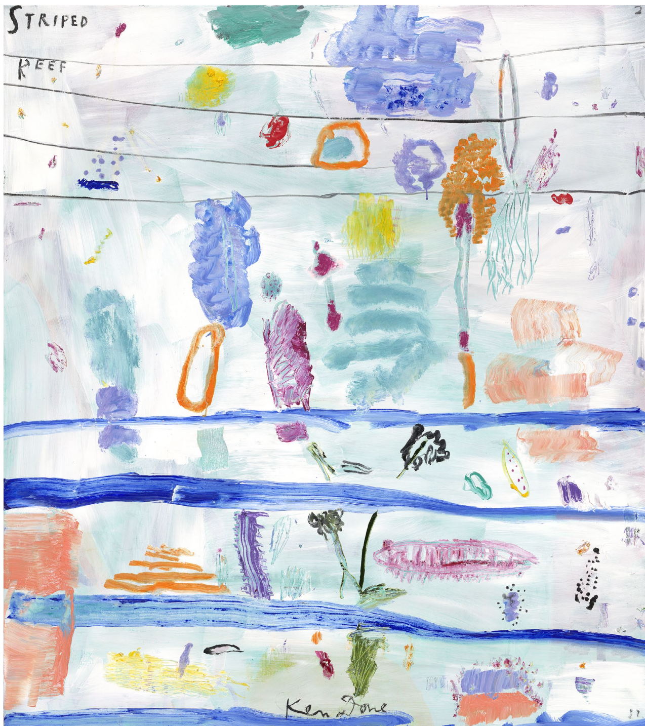
Striped reef II 2022 oil and acrylic on linen 138 cm x 122 cm $30,000