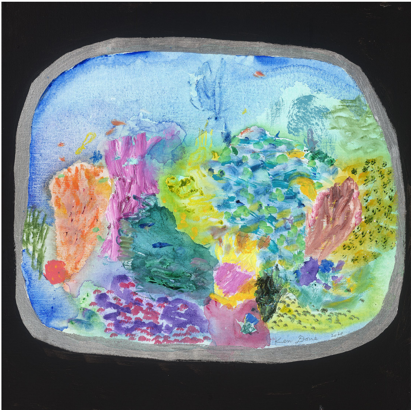
Mask V 2020 acrylic and oil crayon on linen 50 cm x 50 cm $5,500