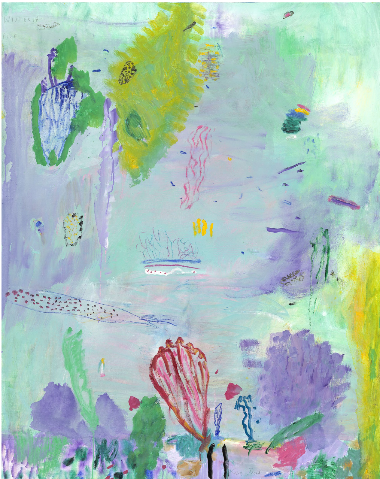
Wisteria reef 2021 oil and acrylic on linen 152 cm x 122 cm $32,000