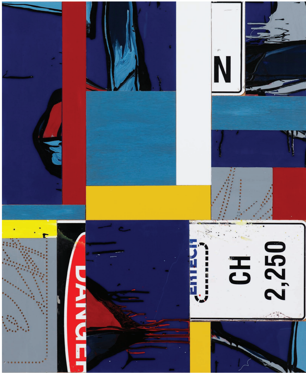
Cover 2250 leagues under the sea 2017 enamel, gloss acrylic, perspex, plywood, aluminium and metal signs on board 120 x 90cm