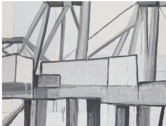
Right Sound and Vision 2019 enamel, gloss acrylic and gesso on aluminium 140 x 180cm