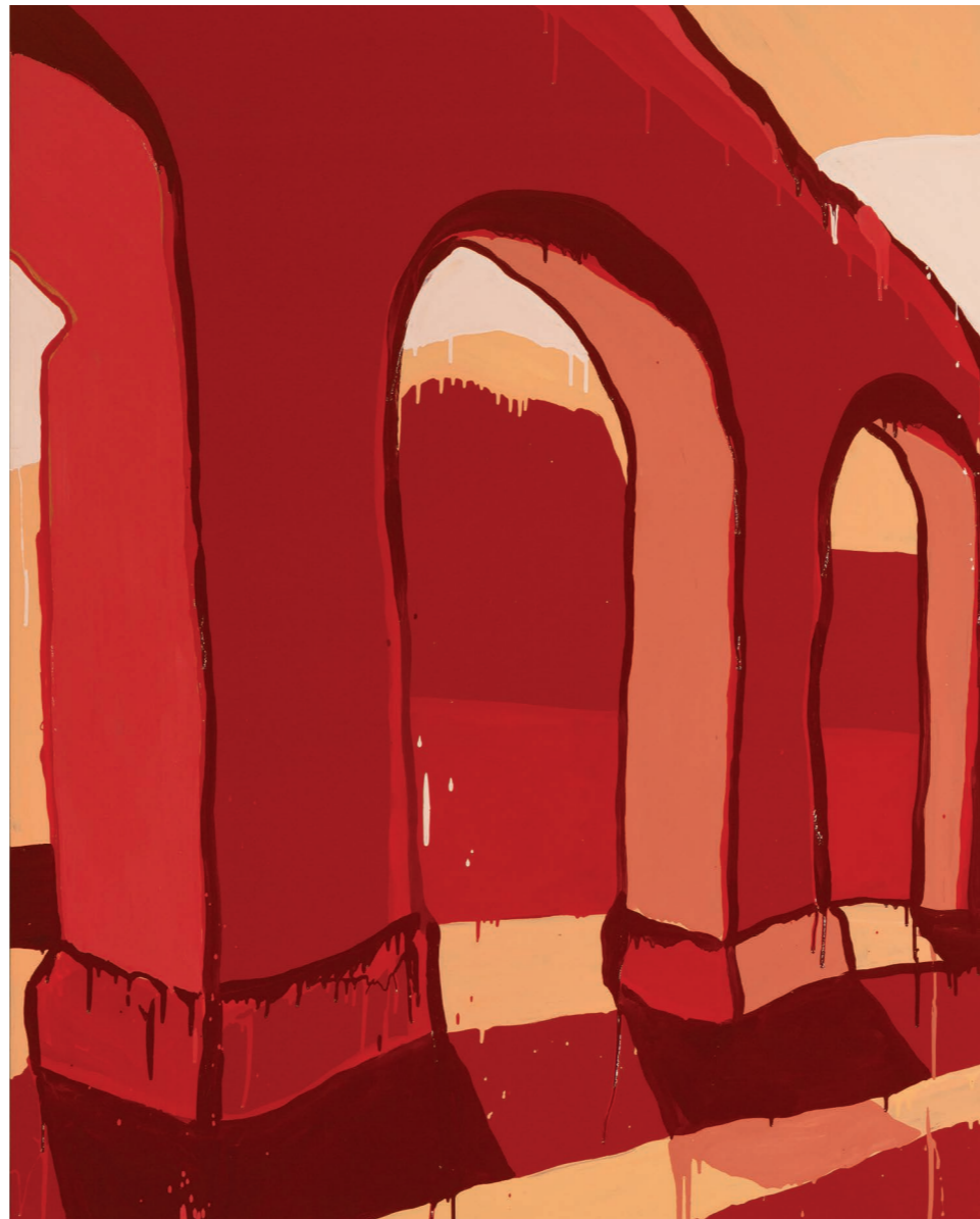
Above Sunken Garden 2019 enamel, gloss acrylic and gesso on aluminium 150 x 120cm

Artworks courtesy of Jasper Knight Jasper Knight is represented by Chalk Horse, Sydney and James Makin Gallery Melbourne