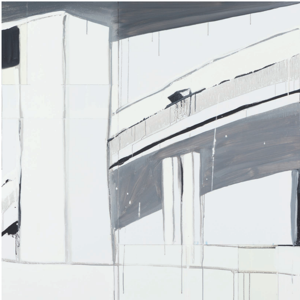
Above Elevator Music 2019 enamel, gloss acrylic and gesso on aluminium 150 x 150cm