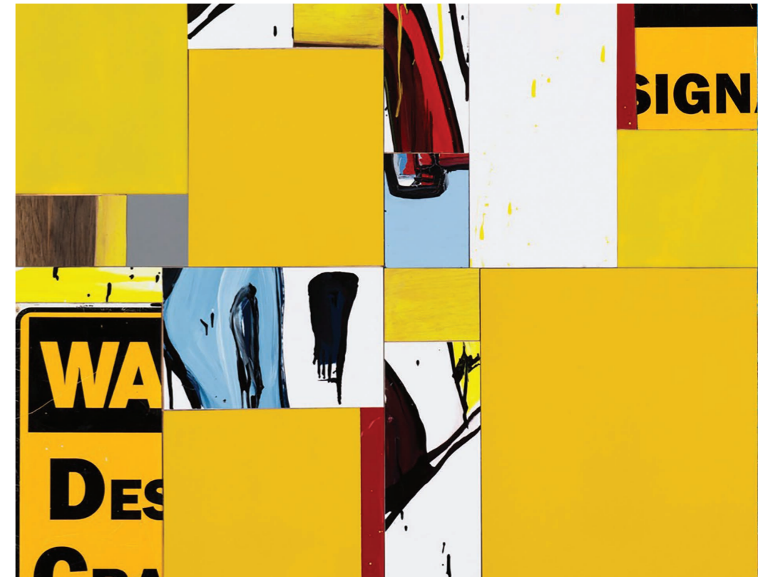
Right Catseye 2017 enamel, gloss acrylic, perspex, plywood, aluminium and metal signs on board 100 x 100cm (detail)